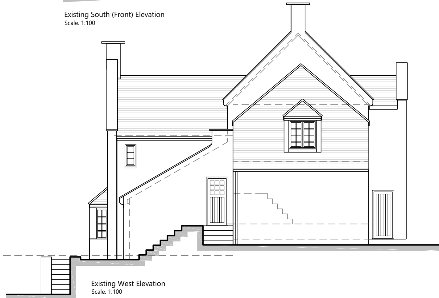
Existing West Elevation Scale: 1:100