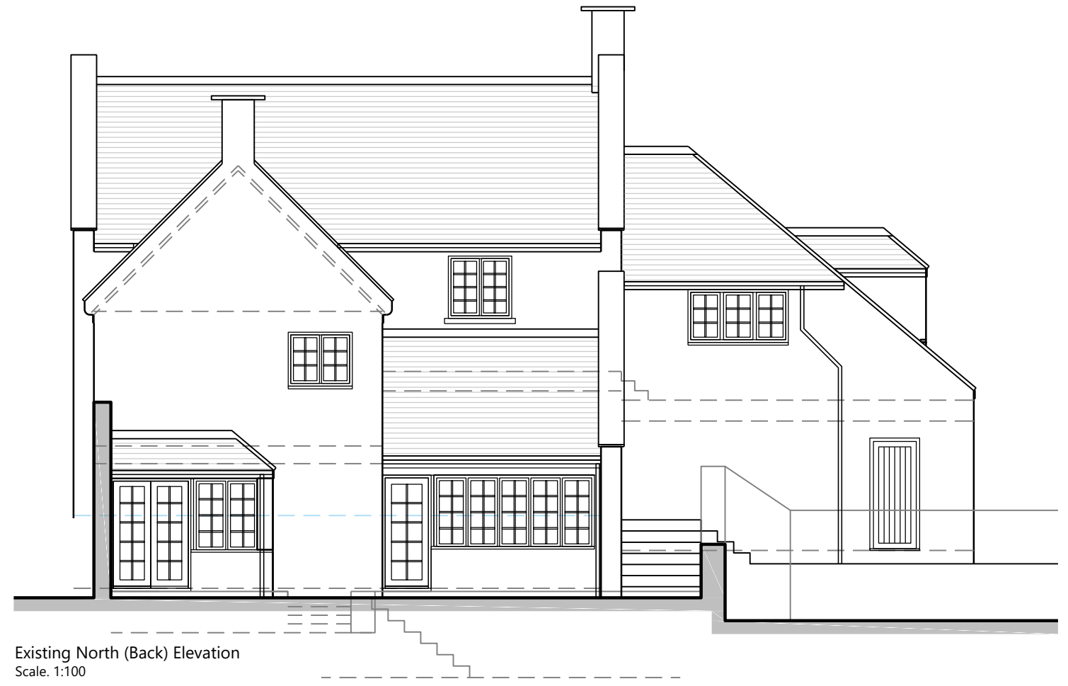
Existing North (Back) Elevation Scale: 1:100