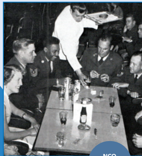
NCO club, 1950s.

USAF NCO Club (for Non Commissioned Officers), Building 472, in 1980.