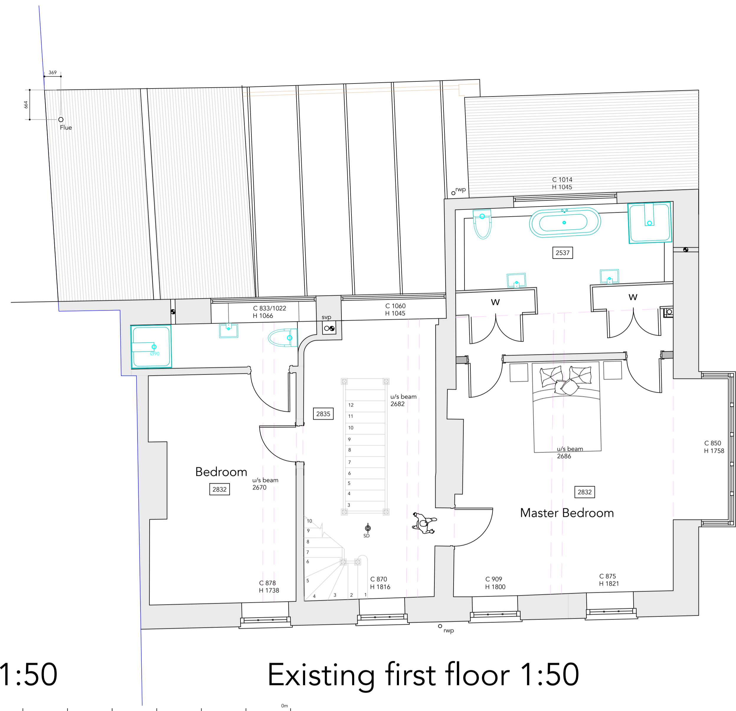
Existing first floor 1:50