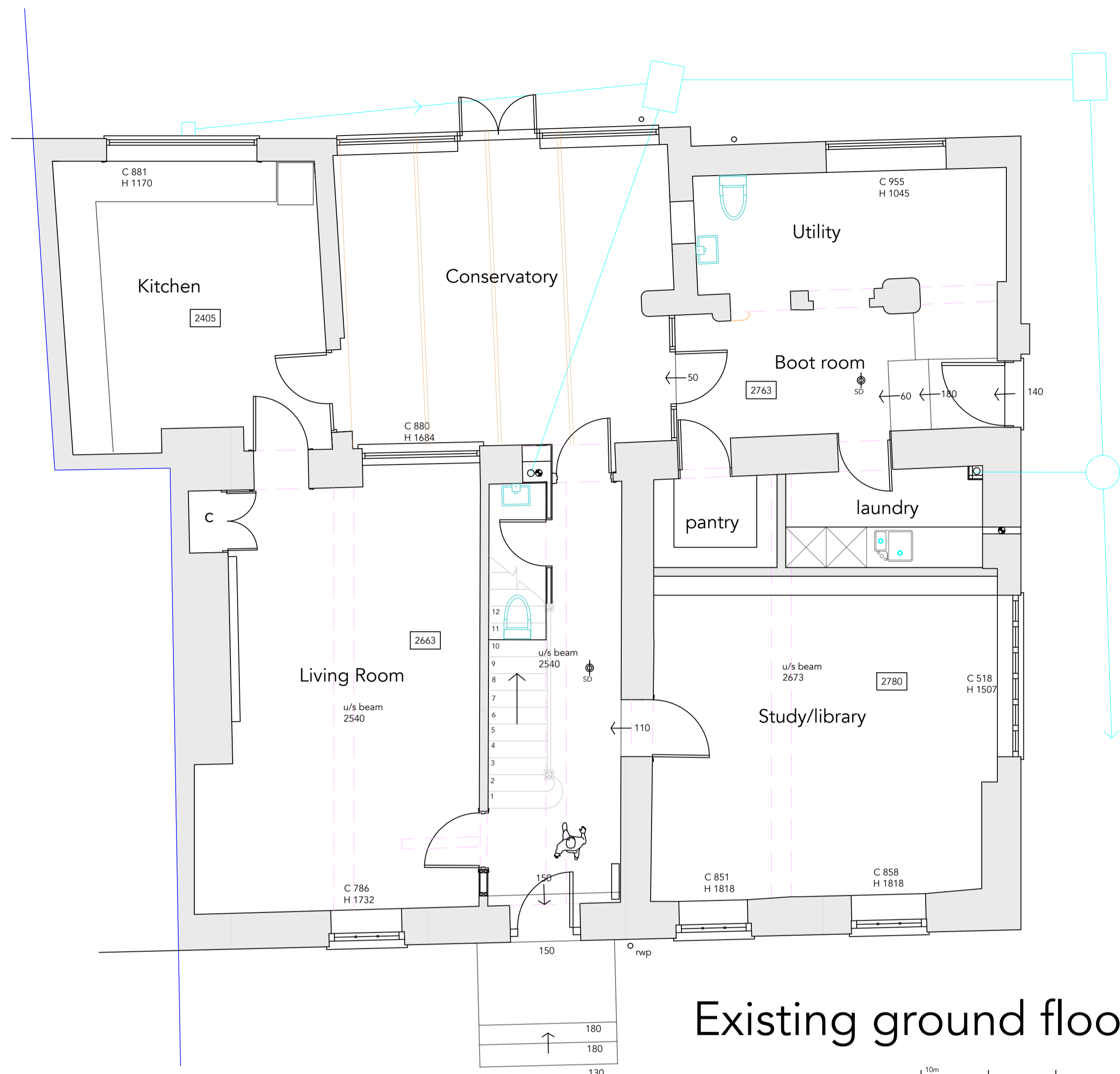
Existing ground floor 1:50