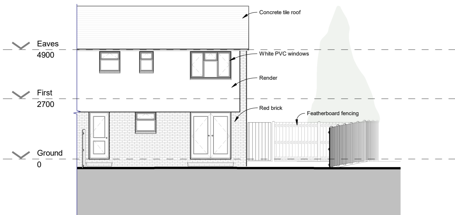
③ Existing North Elevation 1 : 100