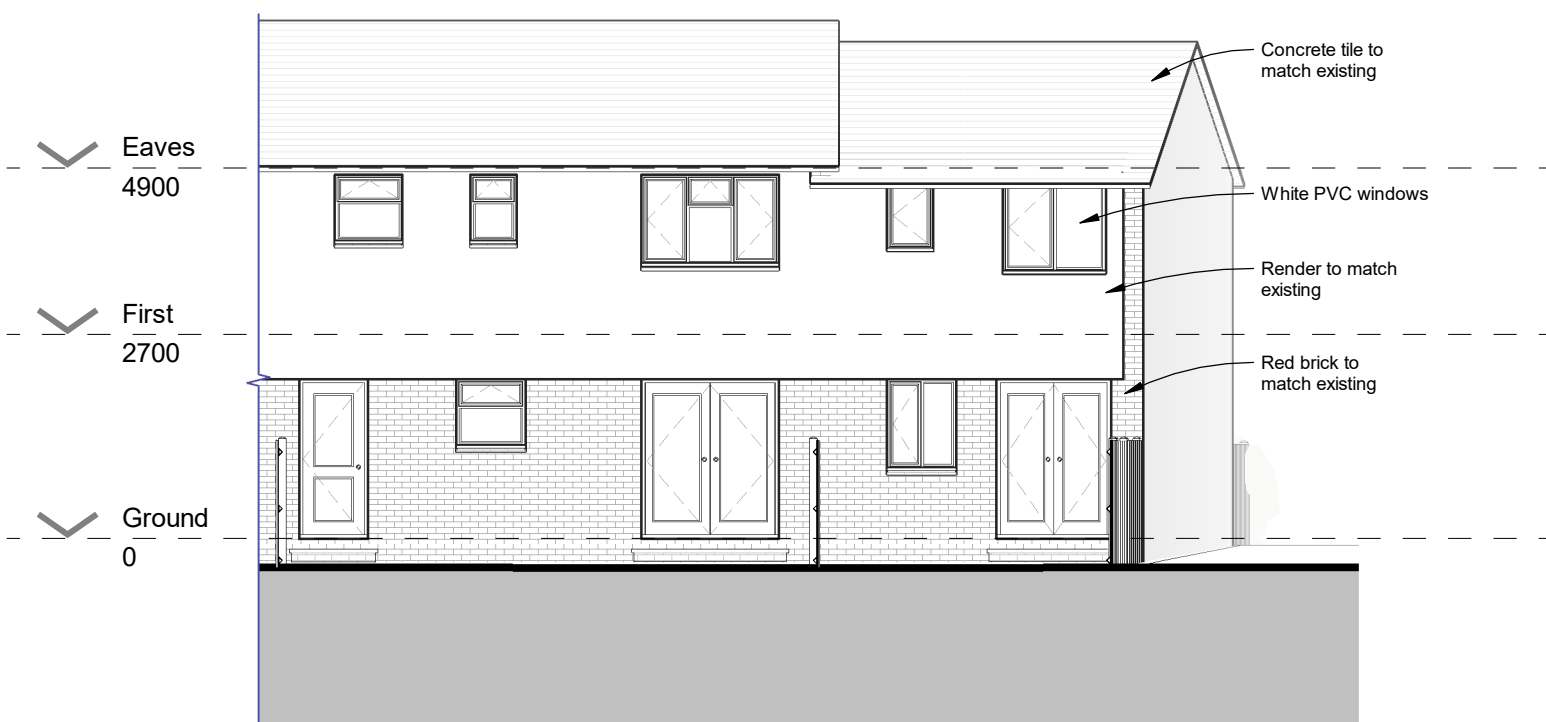
③ Proposed North Elevation 1 : 100