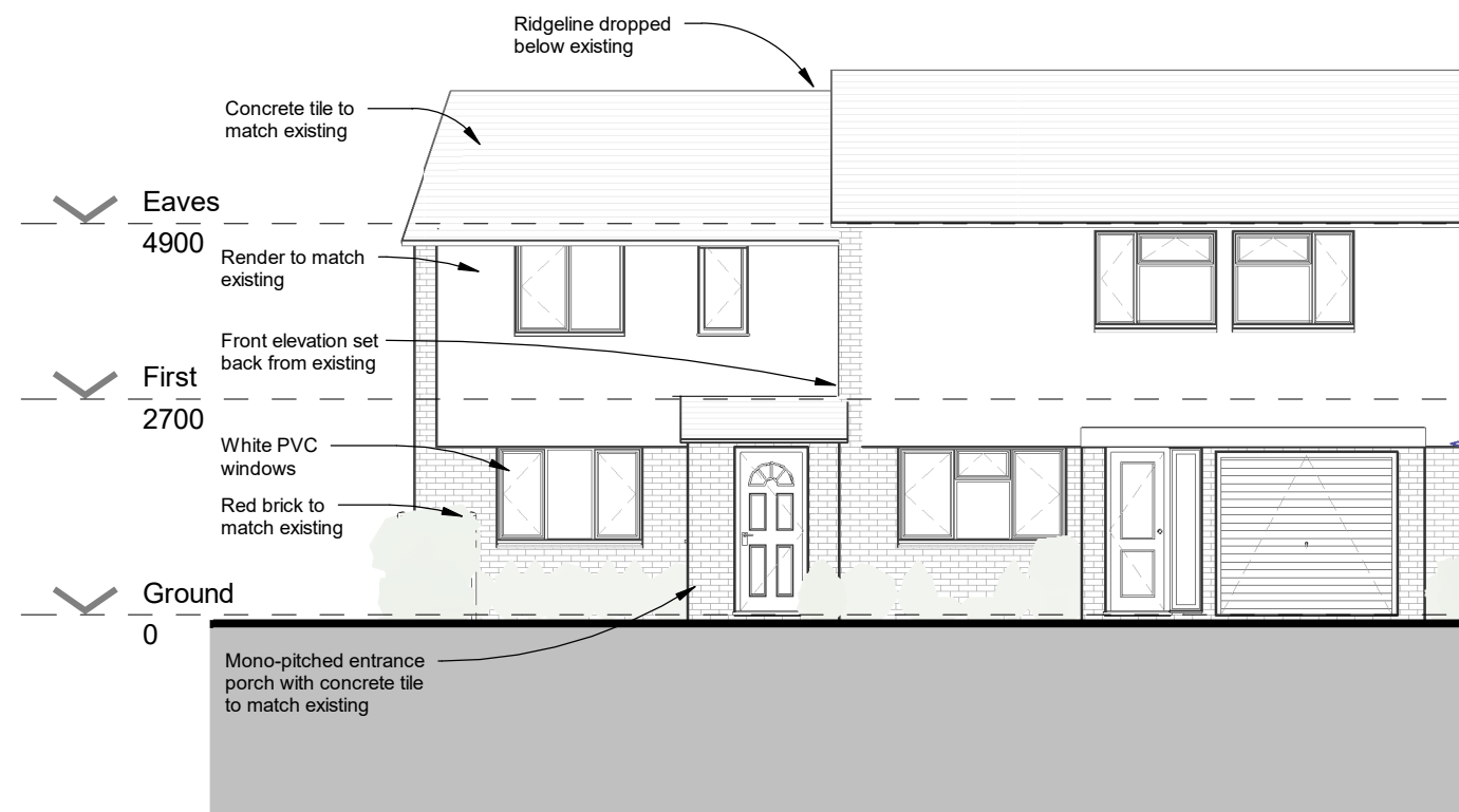
① Proposed South Elevation 1 : 100