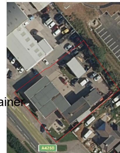
2 Satellite Site Location Plan