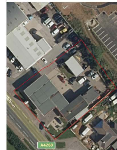
3 Satellite Site Location Plan