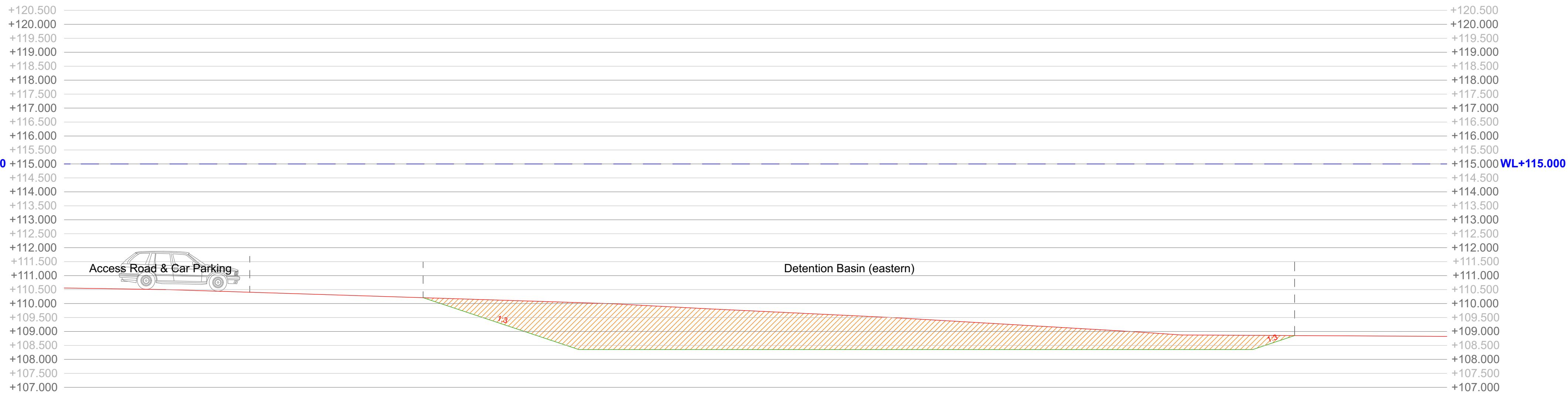
PROPOSED EASTERN DETENTION BASIN TYPICAL SECTION Scale 1:100