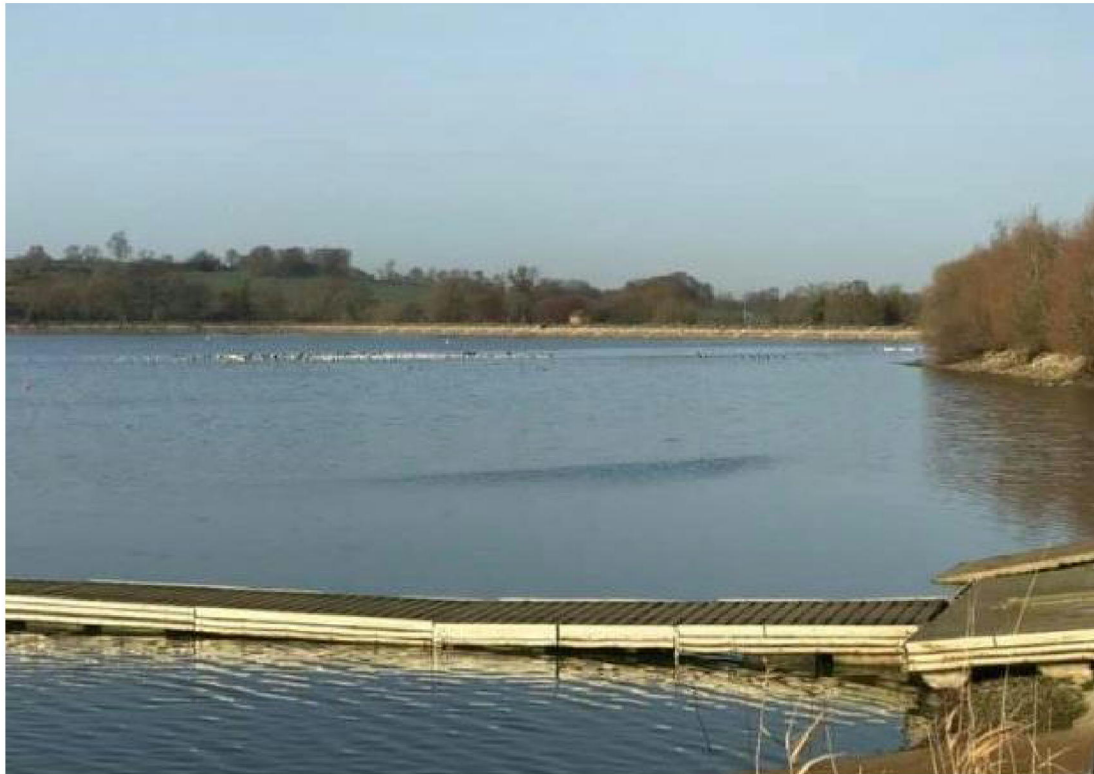
11 th December 2018: Photo of northern half of reservoir showing water level not recovered and shallows in middle evidenced by birds standing.