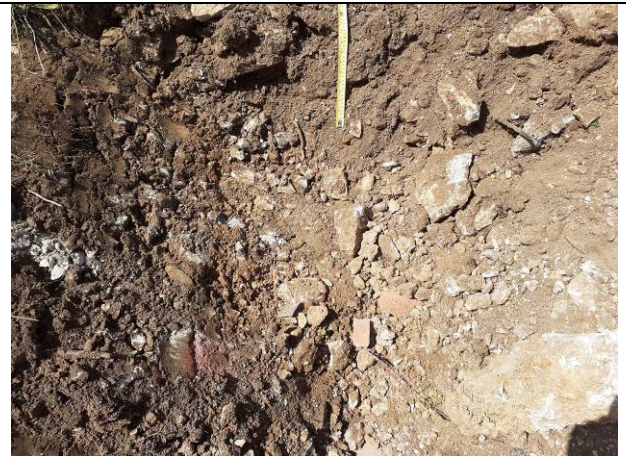
24.06.20 – TP9