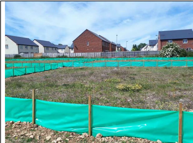
02.06.20 – Western view