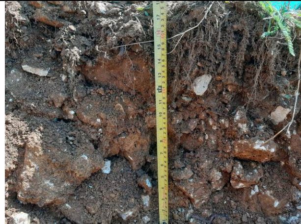
24.06.20 – TP8