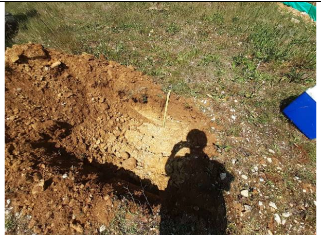
24.06.20 – TP1