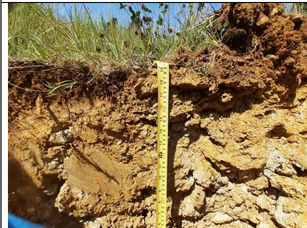
24.06.20 – TP2