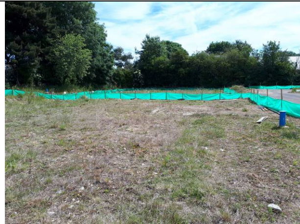
02.06.20 – Eastern view across the northern part of the site