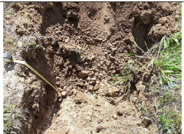
24.06.20 – TP6