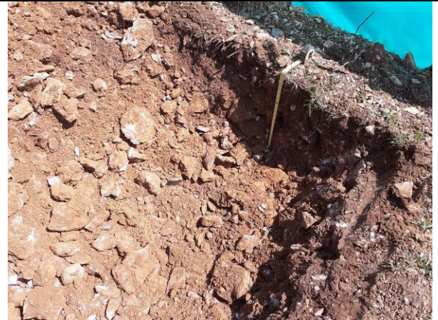
24.06.20 – TP8