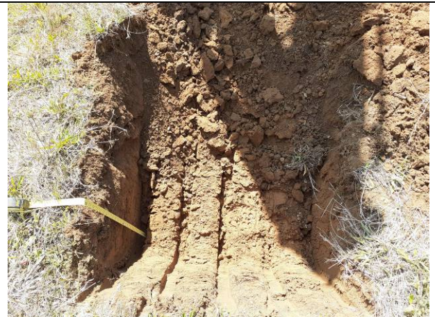
24.06.20 – TP5