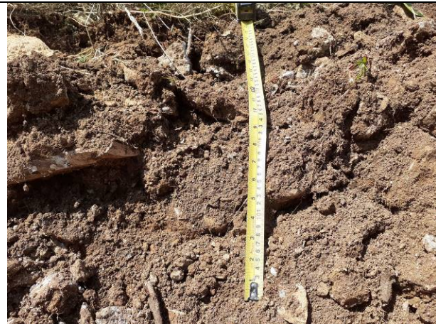
24.06.20 – TP9