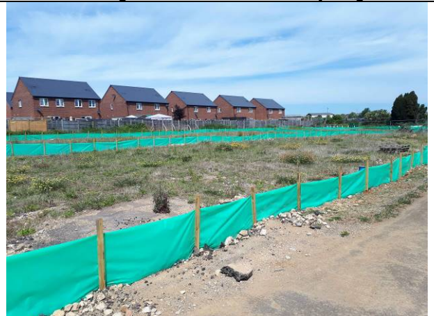
02.06.20 – View across the site from access road