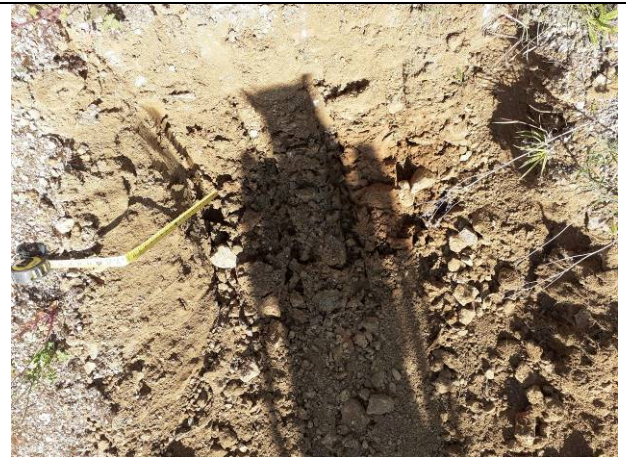
24.06.20 – TP4