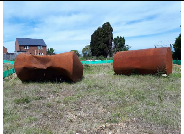
02.06.20 – Removed USTs as part of remedial works awaiting off-site removal for recycling