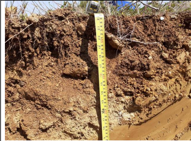
24.06.20 – TP7