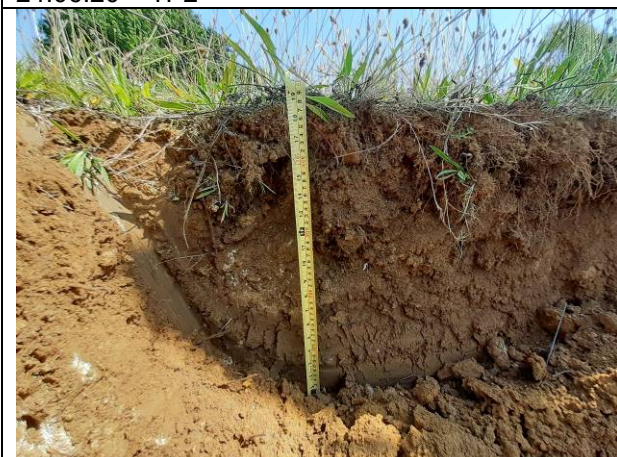
24.06.20 – TP3