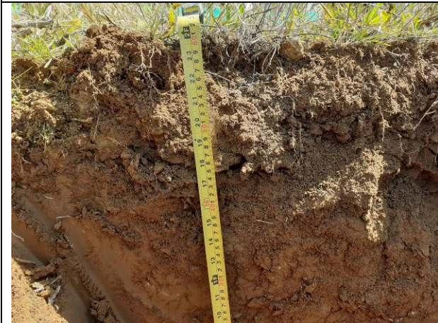
24.06.20 – TP5