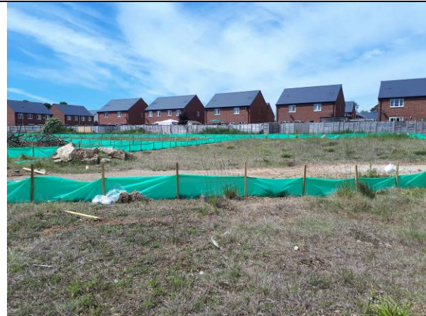
02.06.20 – Site surface occupied by light vegetation. Ecological fencing up during on-going survey work