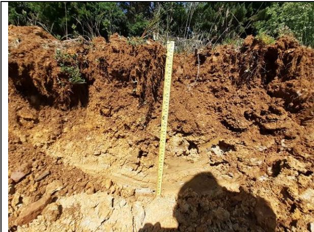
24.06.20 – TP1