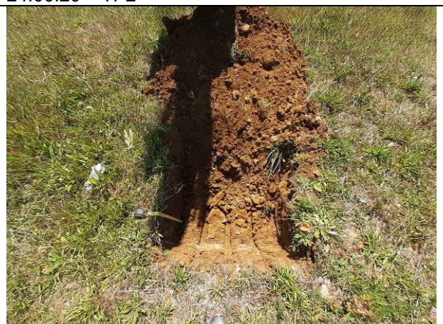
24.06.20 – TP3