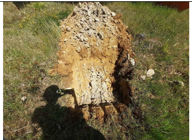
24.06.20 – TP2