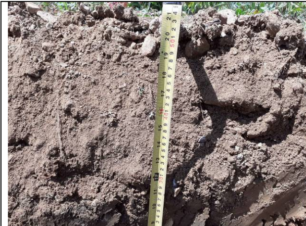
24.06.20 – TP4