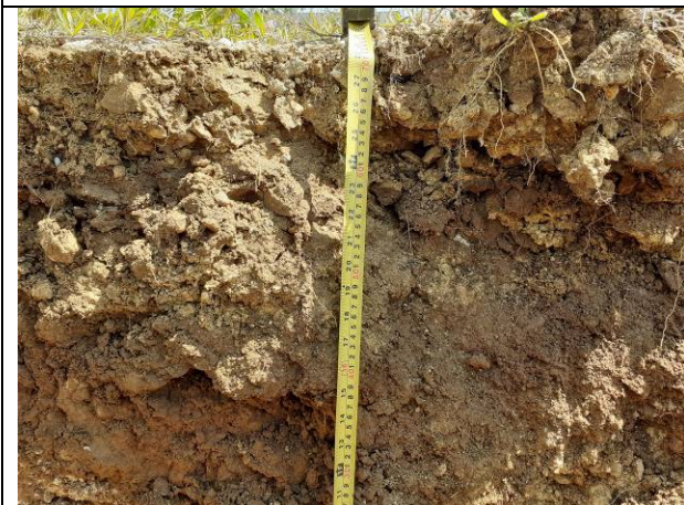
24.06.20 – TP6