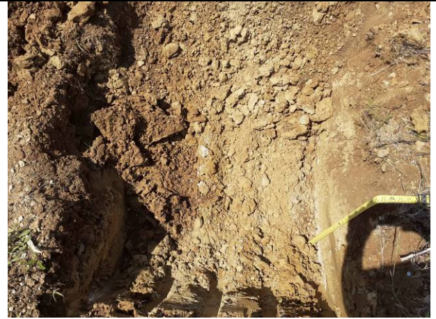
24.06.20 – TP7