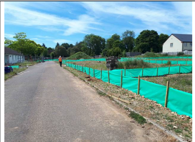
02.06.20 – Southern view down access road