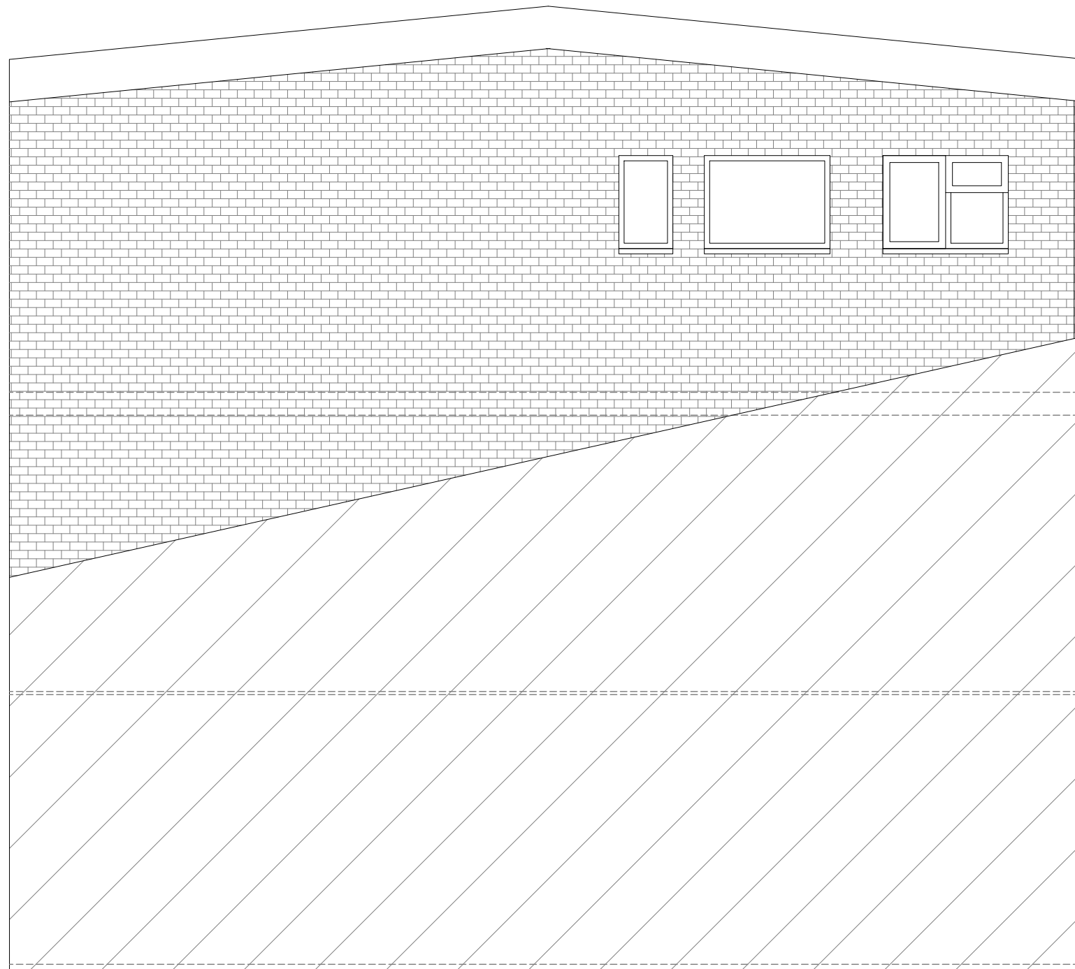
SIDE ELEVATION (south) scale 1:50