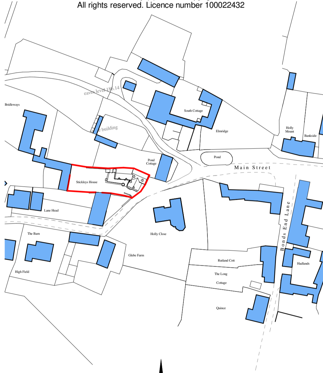
Location Plan 1 : 1250