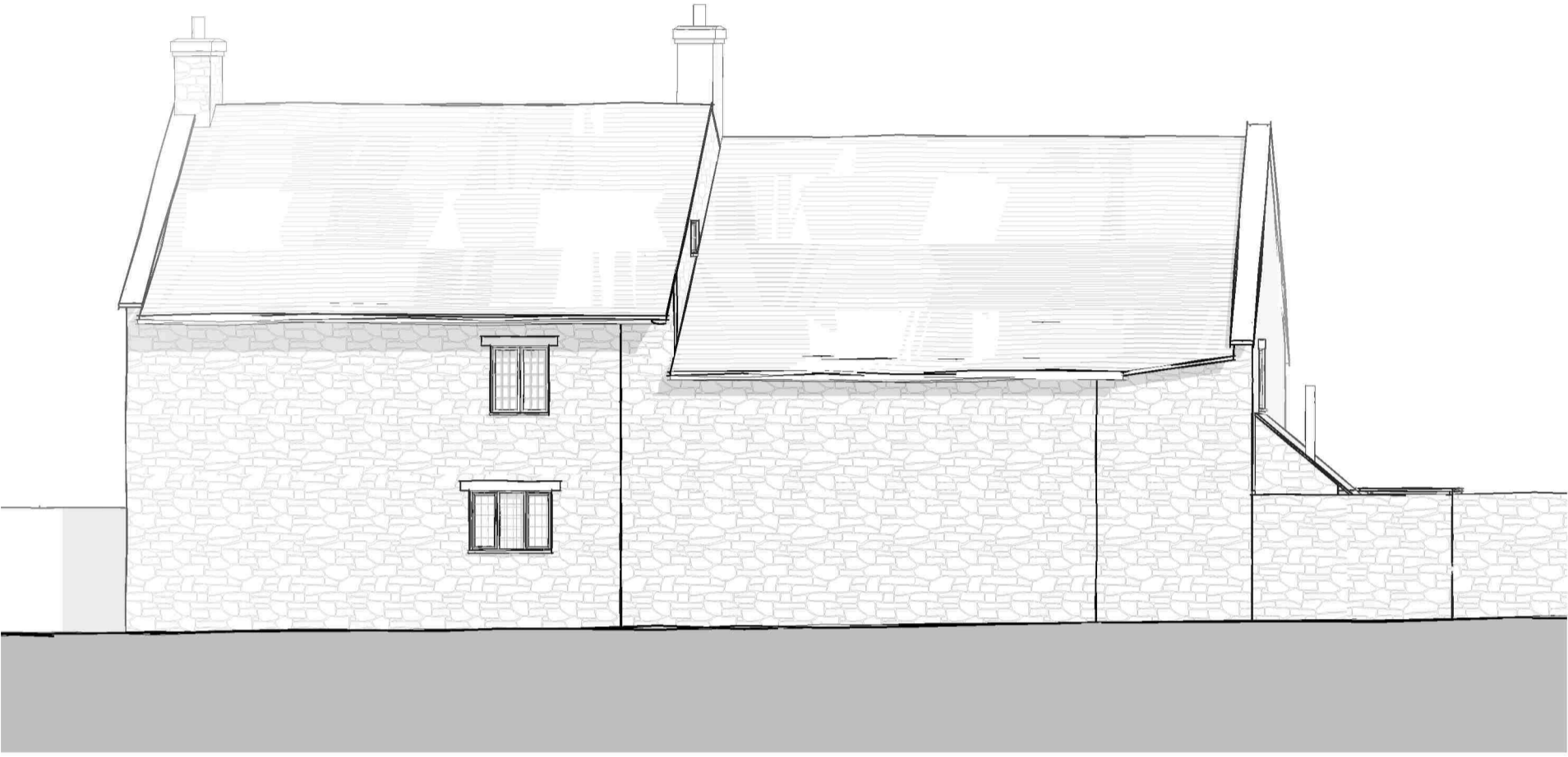
North Elevation 1 : 100