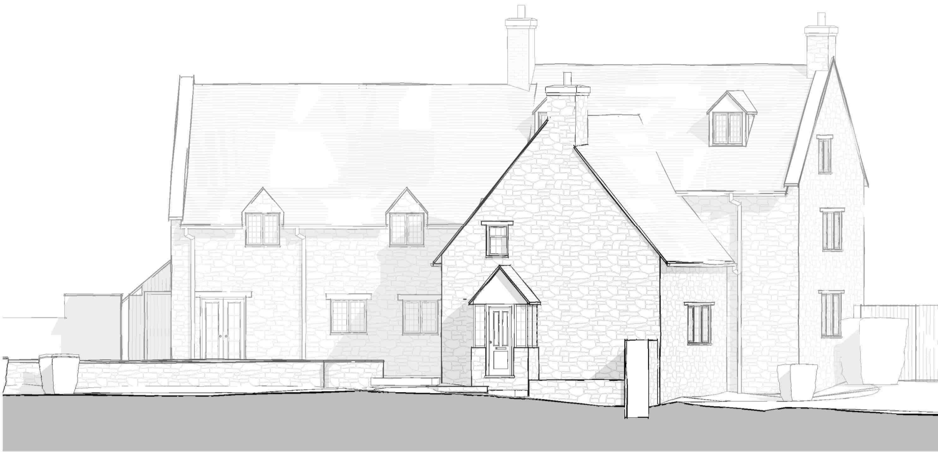
South Elevation 1 : 100