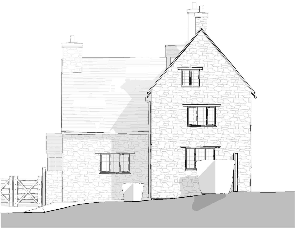
East Elevation 1 : 100