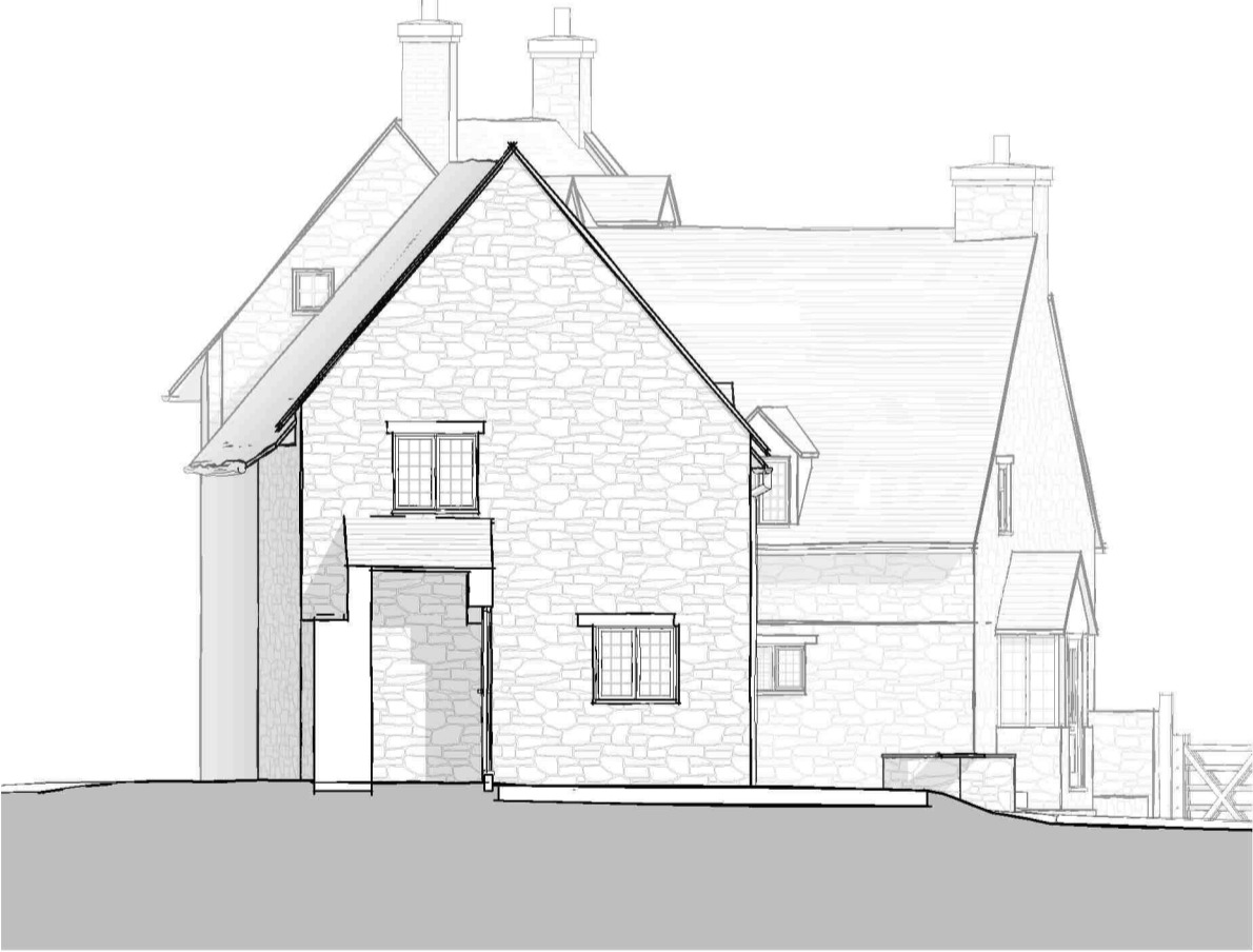
West Elevation 1 : 100