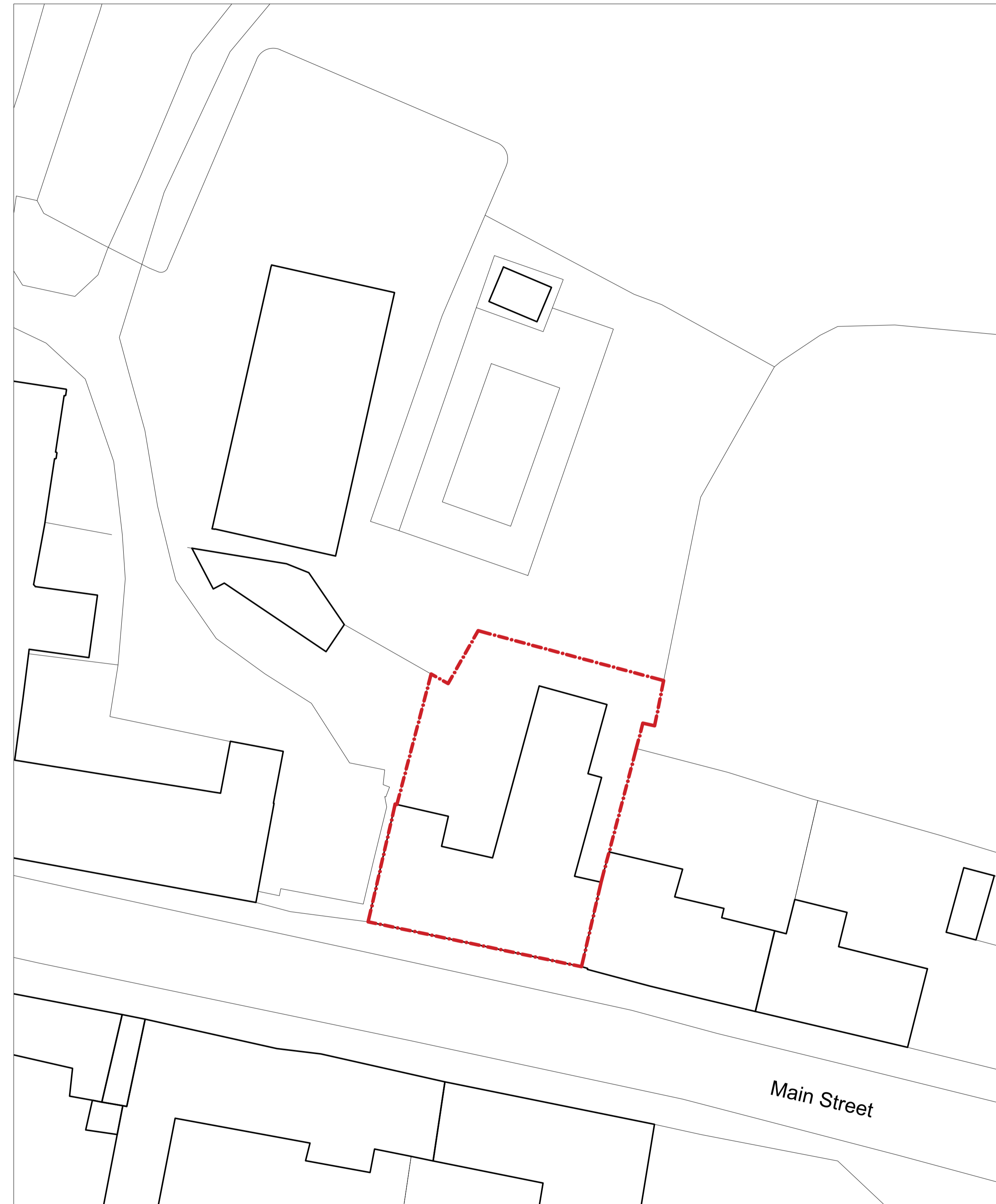
02 Block Plan 1:200