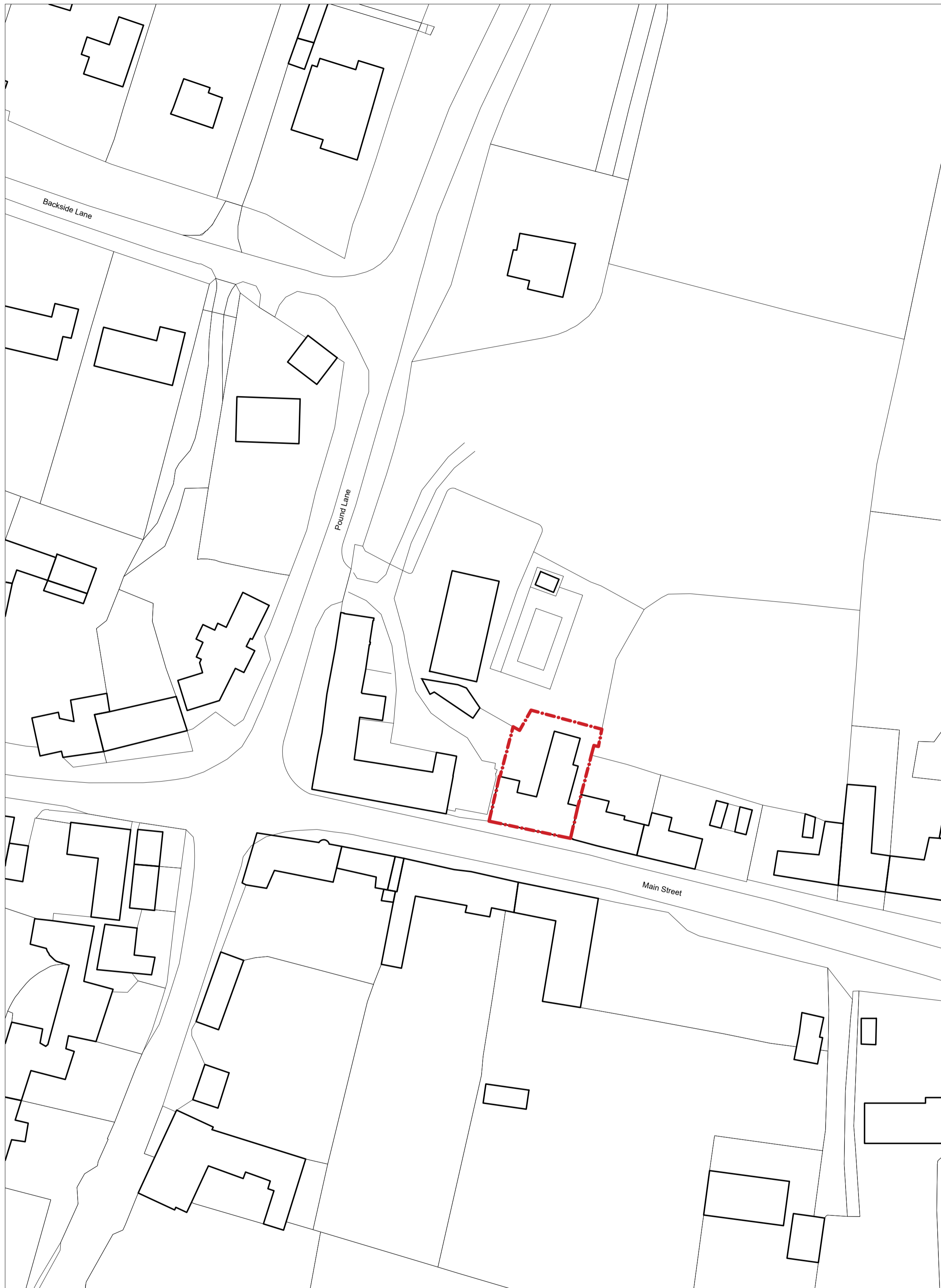
01 Site Location Plan 1:500