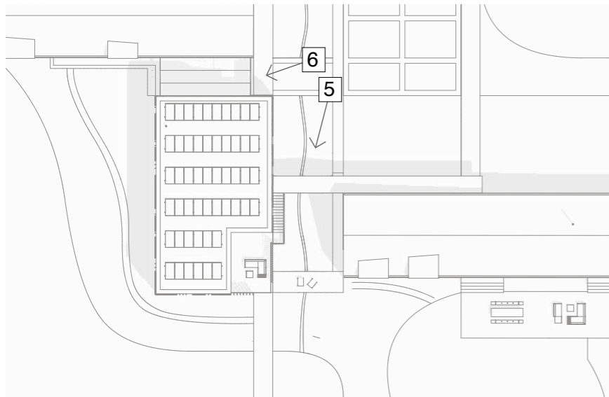
location of views

It is only as you approach the front door that you glimpse for the first time the body of water beyond and the dramatic double-height space and cantilevered staircase