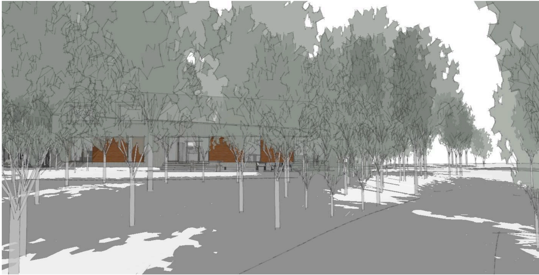
View 1 (left) As you approach along the driveway, the first glimpse of the house through the trees is of Emma's wing