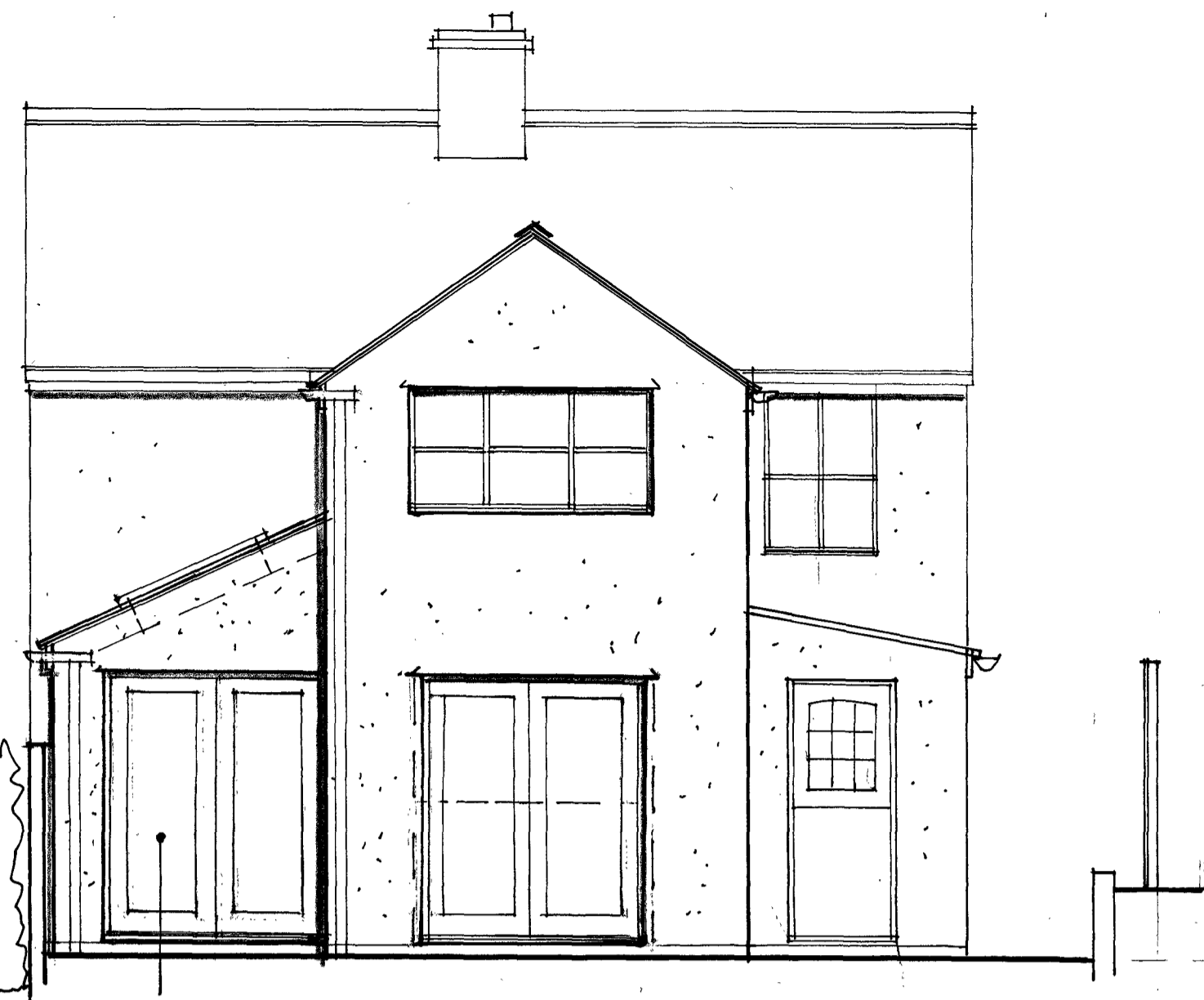
PROPOSED EXTENSION rear