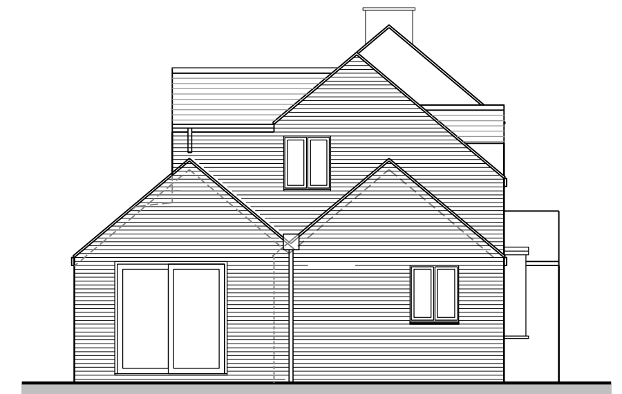
Existing West Elevation Scale: 1:100