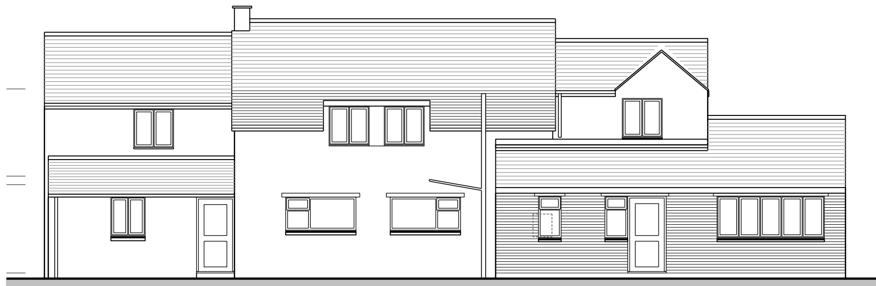
Existing North (Back) Elevation Scale: 1:100