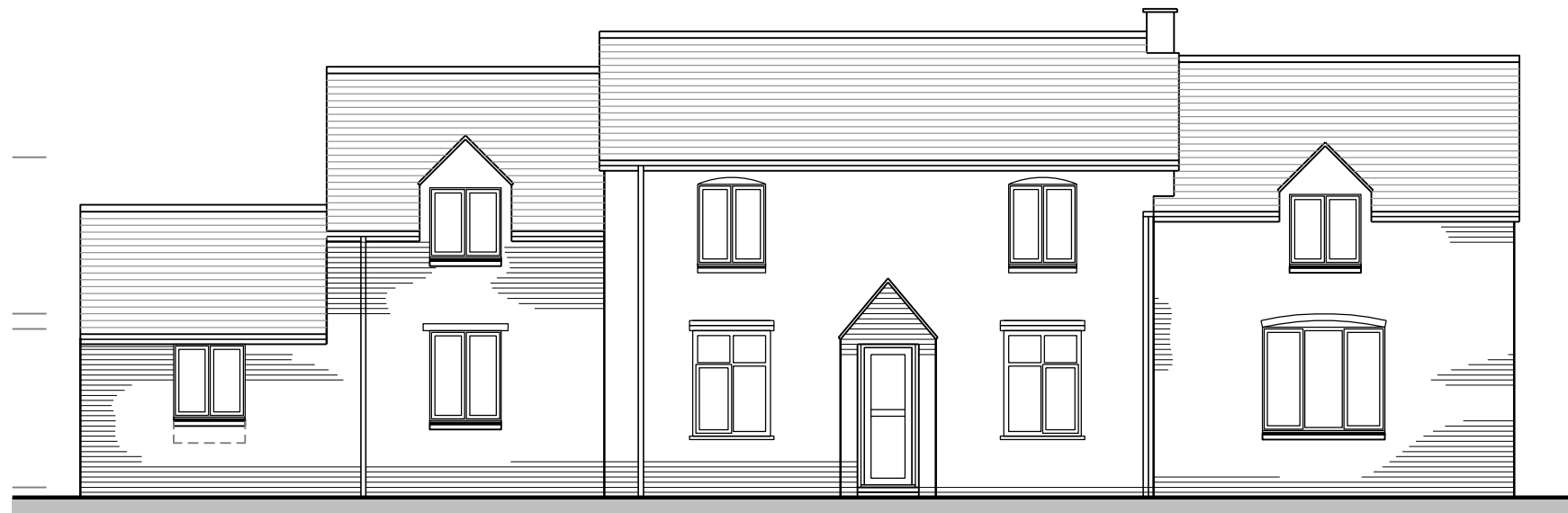
Existing South (Front) Elevation Scale: 1:100

Materials: Walls: Brick (red) & render (white) Roof: Slate tiles Windows: Timber or UPVC (white) Doors: Timber or aluminium (white & grey)