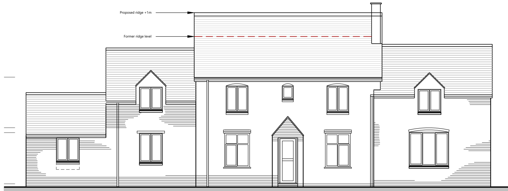
Proposed South (Front) Elevation Scale: 1:100

Materials: Existing: Walls: Brick (red) & render (white) Roof: Slate tiles Windows: Timber or UPVC (white) Doors: Timber or aluminium (white & grey) Proposed: All to match the existing