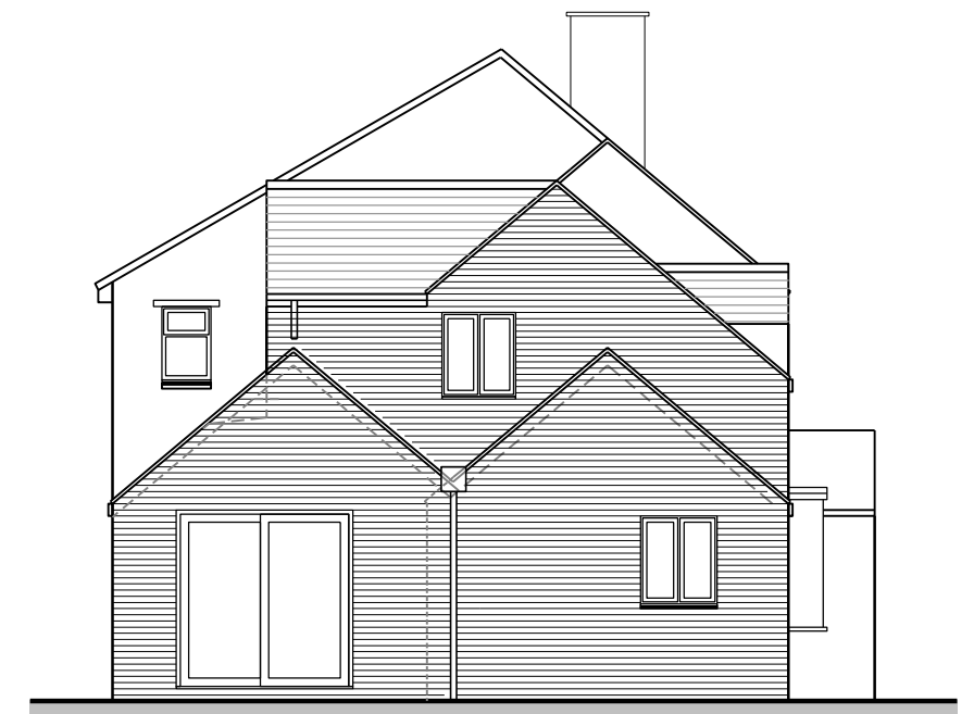
Proposed West Elevation Scale: 1:100