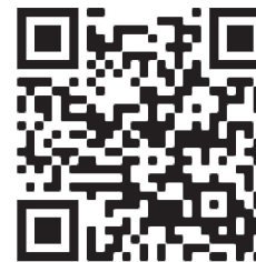
GOOGLE MAPS QR CODE

GOOGLE MAPS - https://goo.gl/maps/uRYXgcrityW7VkrJ9 GOOGLE STREET VIEW - https://goo.gl/maps/UQBVE1Zsq8nNyXRQA