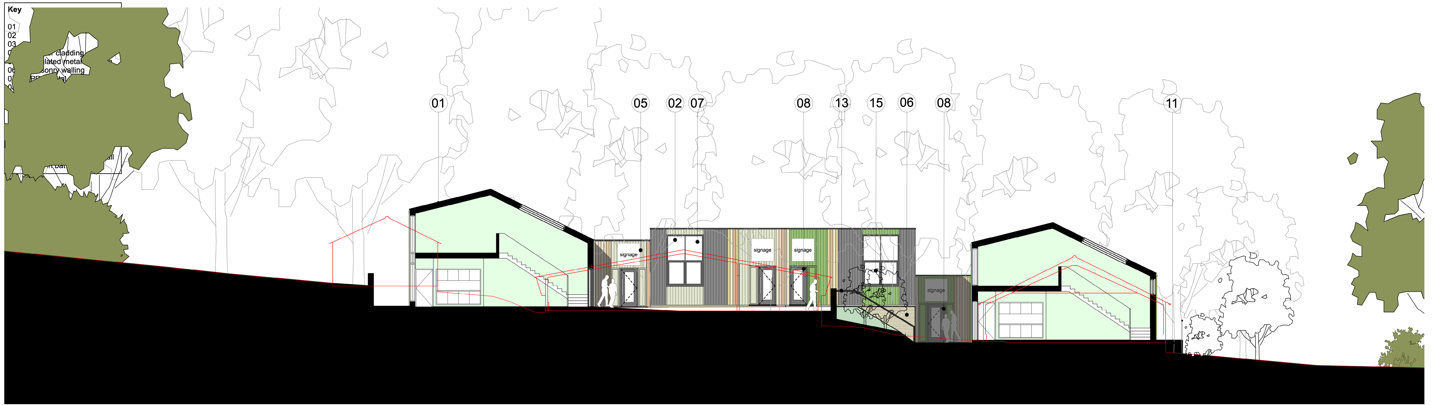
1 Proposed Section A-A Scale: 1:100