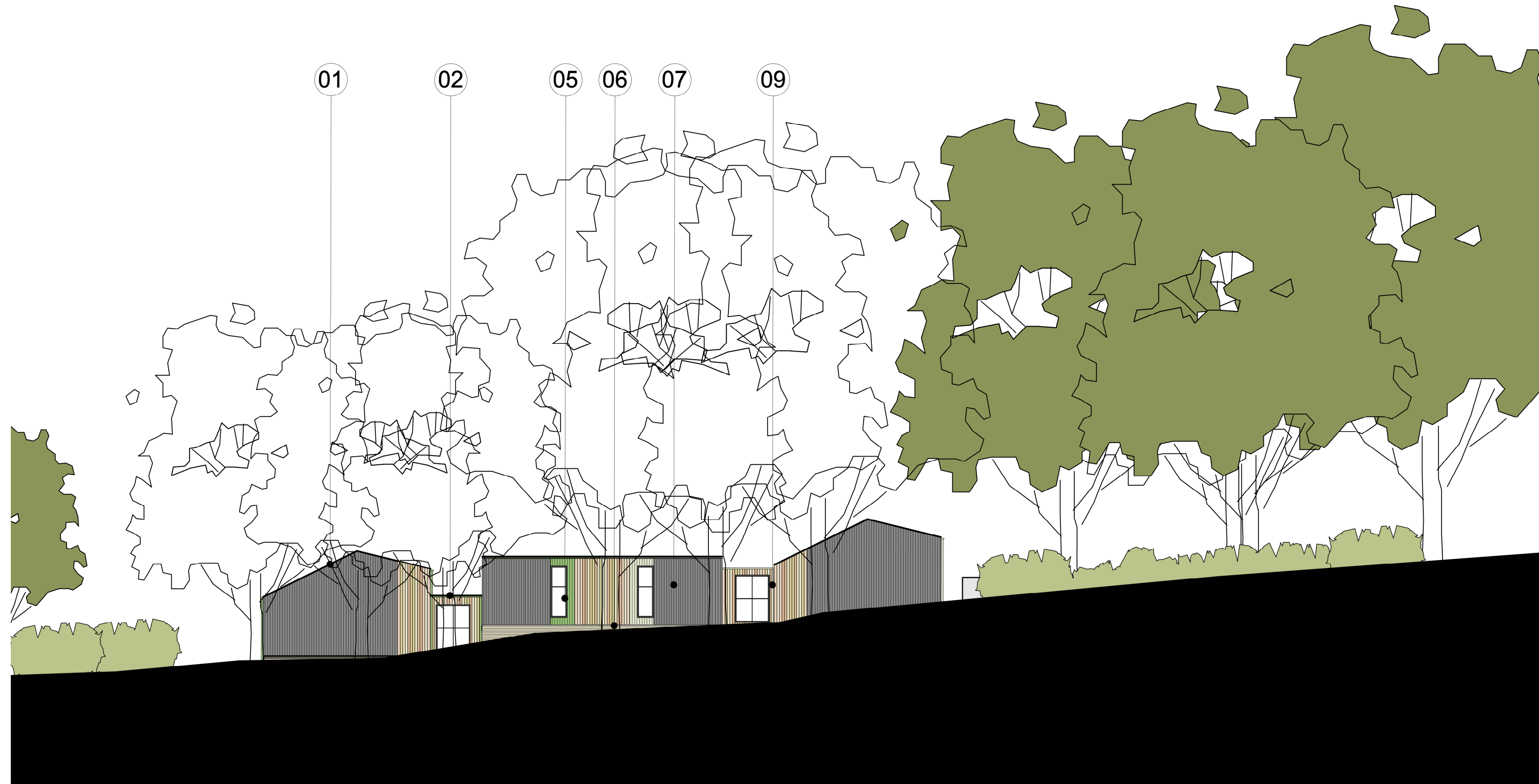
1 Proposed North Elevation Scale: 1:200