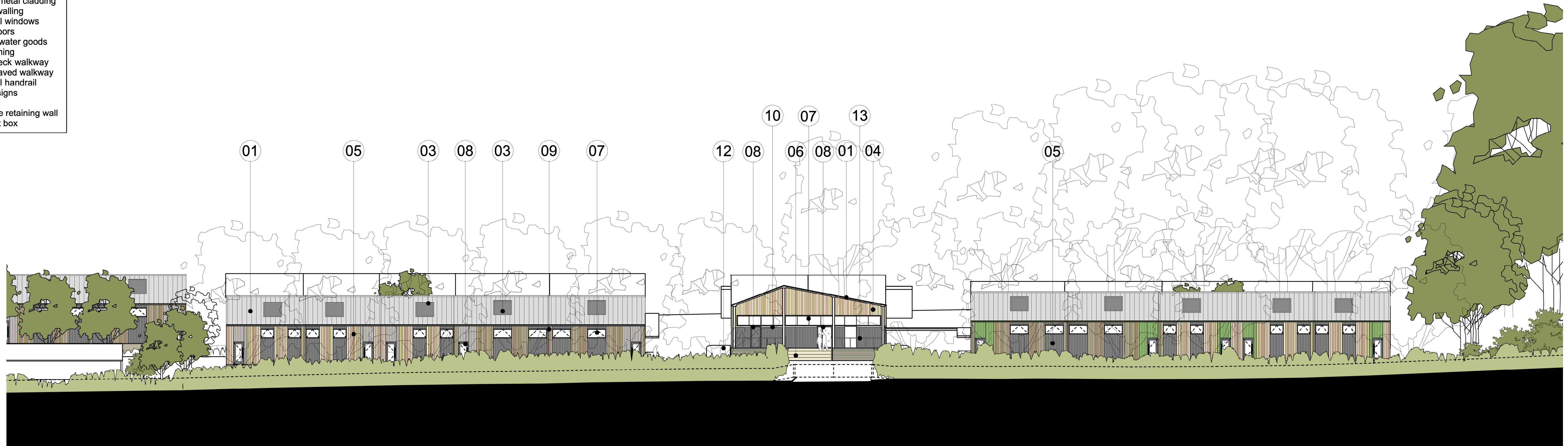
1 Proposed Street (East) Elevation Scale: 1:200