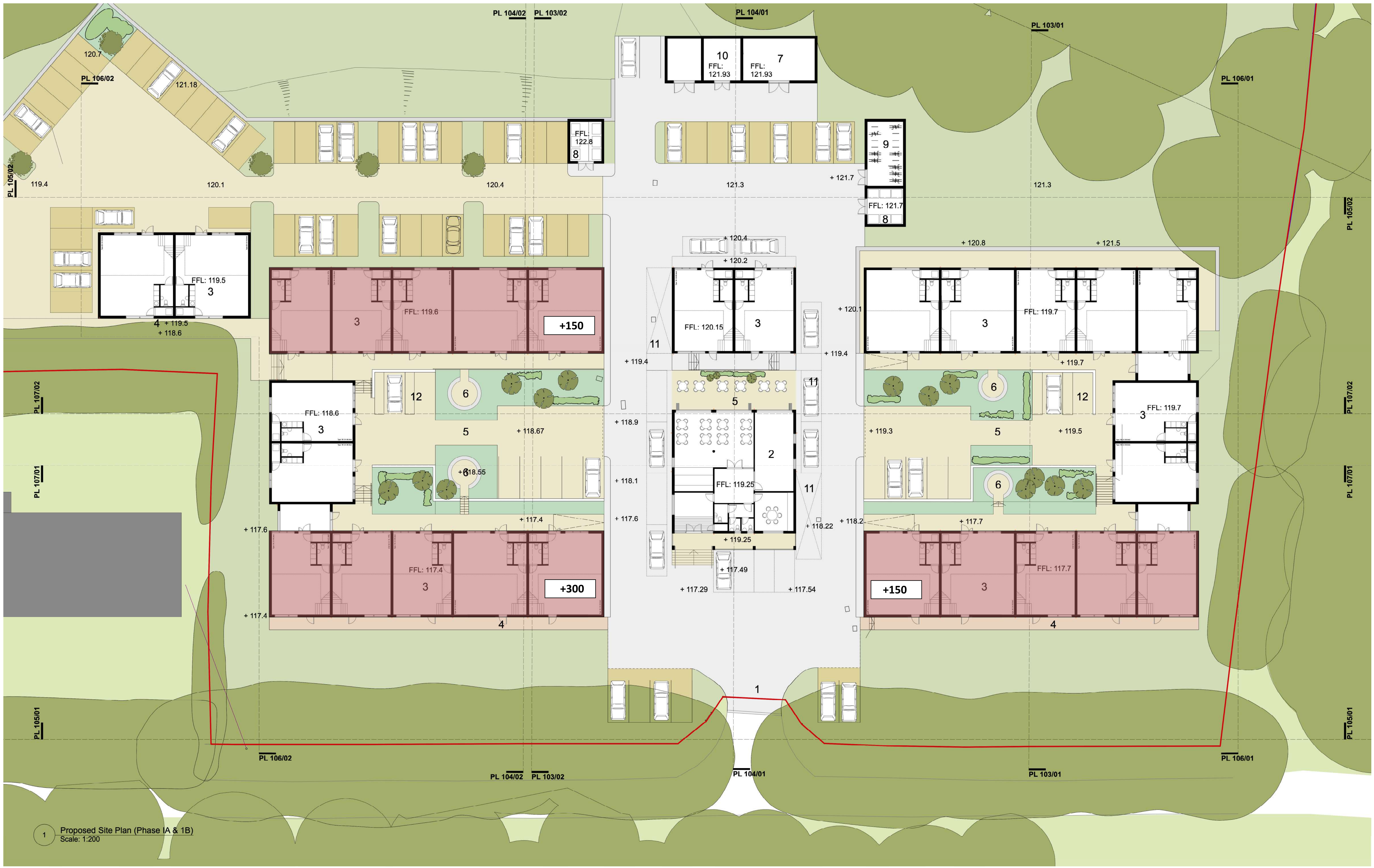
1 Proposed Site Plan (Phase IA & 1B) Scale: 1:200