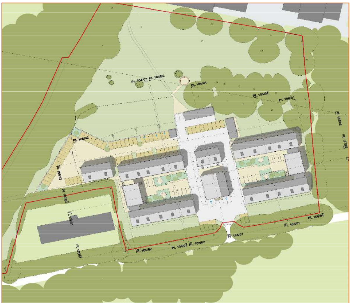
Figure 2.1: Proposed Site Layout

Note: Site Layout subject to change during planning application consultation