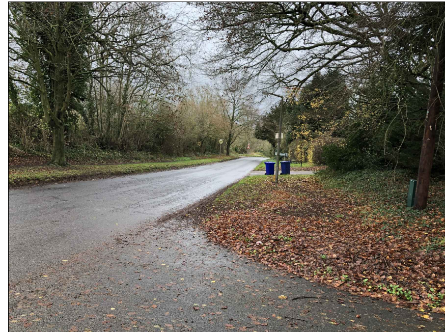
Visibility to right of site access