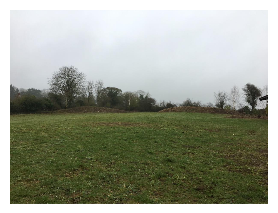
Figure 10 – View of the field to the west of the The Beeches House, looking east to west.