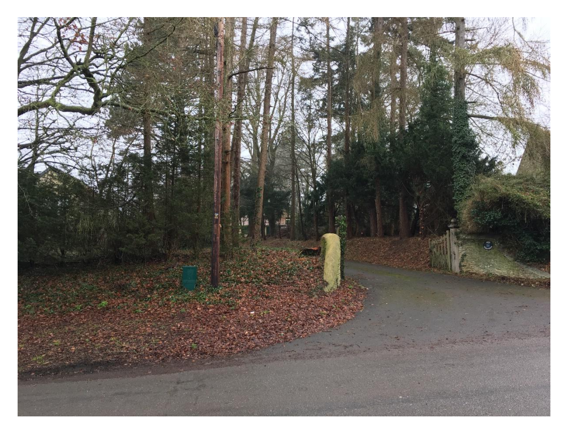
Figure 11 – View of The Beeches from within Rousham Conservation Area, looking east to west.