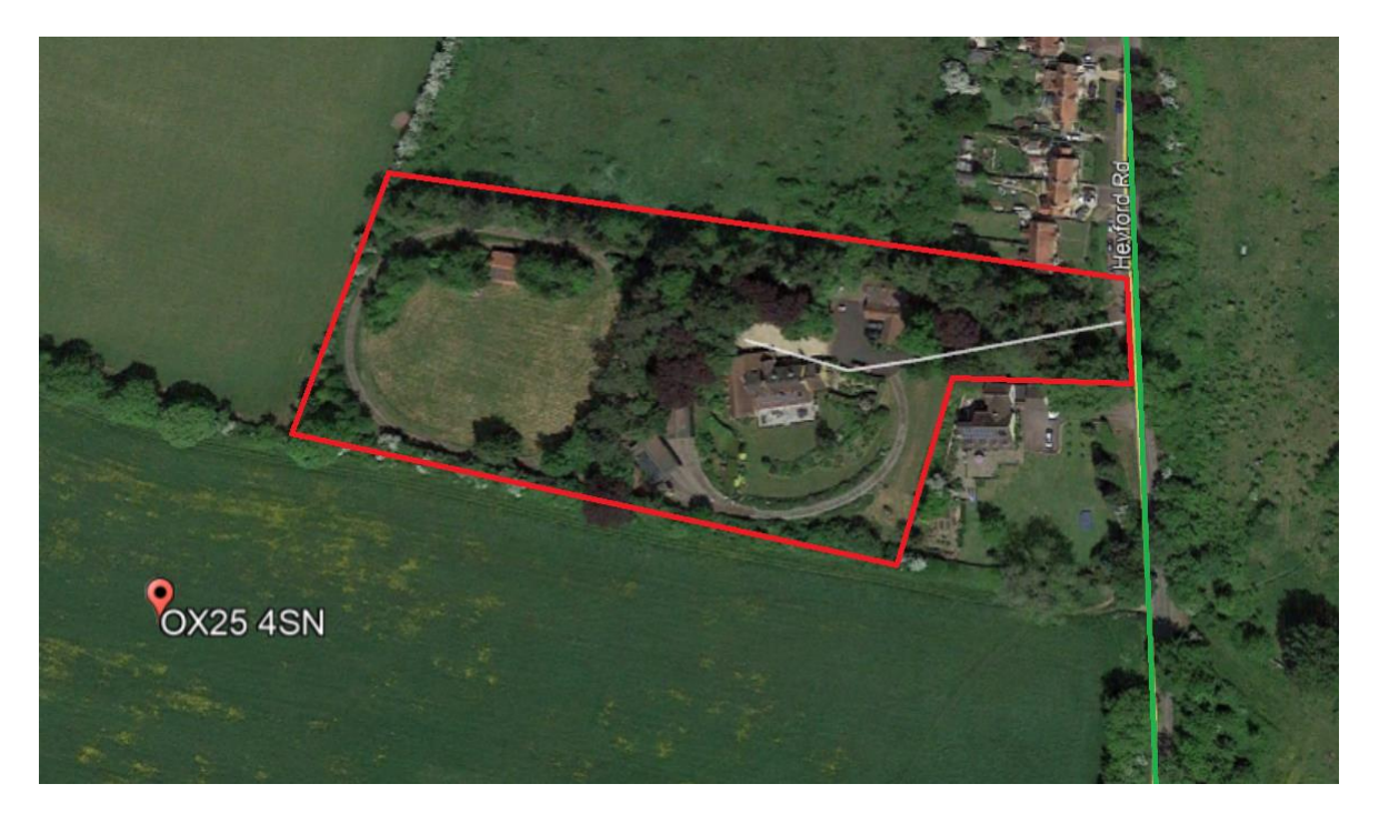
Figure 1 – Site location (in red). Rousham Conservation Area is on the opposite side of Heyford Road (east) with the boundary marked by the green line.

1.1 This heritage assessment has been prepared by the Heritage Collective for Adrian Shooter. It relates to an outline planning application for the erection of up to 8 dwellings in the domestic curtilage of The Beeches, Heyford Road, Steeple Aston (post code: OX25 4SN; Figure 1).