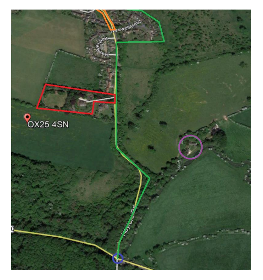
Figure 2 – Photo showing site location (red), Cuttle Mill Complex (purple), Heyford Bridge (blue), Rousham Conservation Area boundary (green) and Steeple Aston Conservation Area boundary (orange).

1.6 This assessment will assess the character and appearance of Rousham Conservation Area and to what degree the proposed site contributes to the setting of the conservation area. It will then discuss the effects of the proposal on the setting and the character and appearance of the conservation area.