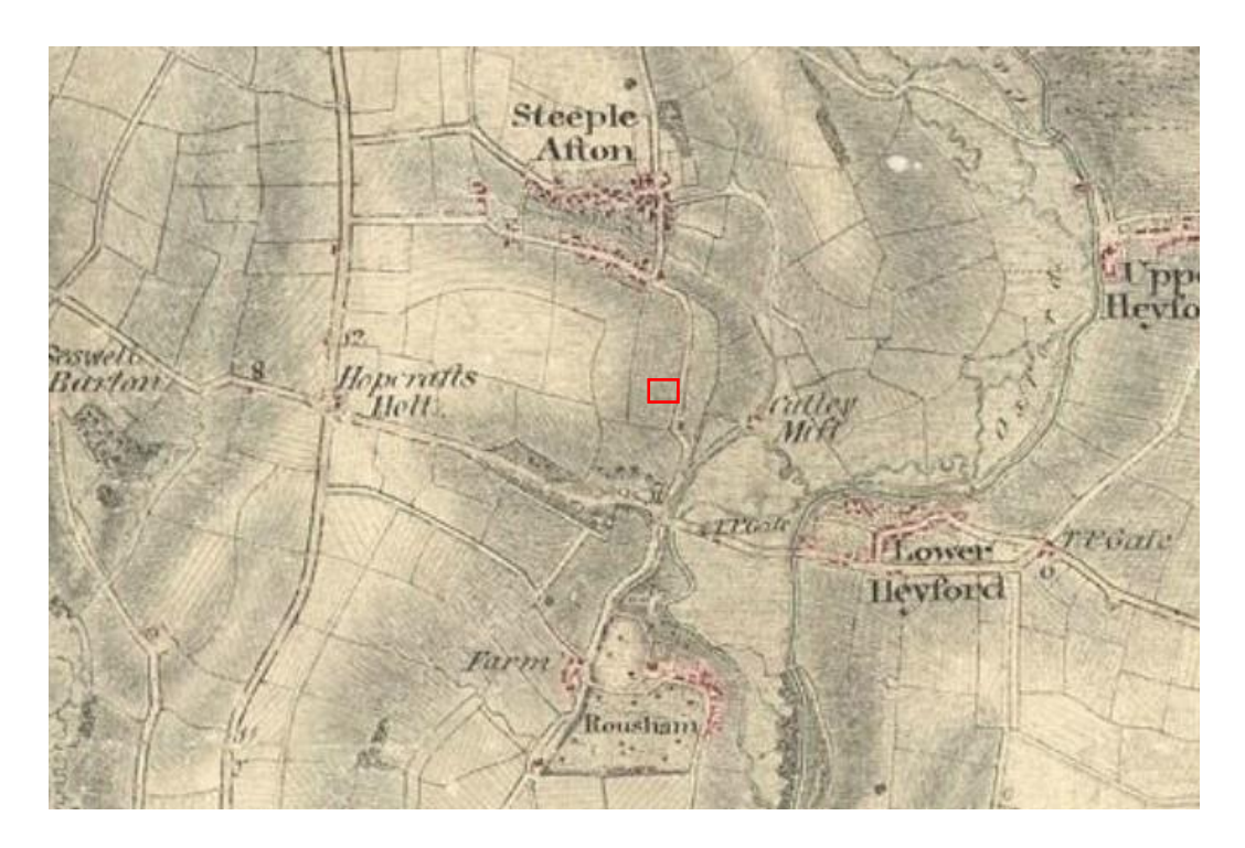
Figure 4 – Extract of William Stanley's map of Bicester 1815. Approximate site location is marked in red.

3.5 Not only did Rousham House and the Cotterell-Dormer family have an affect on the surrounding landscape, they also had a wider effect on the economy of the Steeple Aston area. By 1841 the family were the principal land owners within the village. Tradesman and artisans began to settle in the area and agricultural employment began to decline. A large number of mansion houses were built in the area and these became a large source of employment, mainly due to their need for domestic servants. This did not mean that the area did not face poverty and unemployment, with many struggling to pay the high rents and the maintenance of the village declining. Things became so severe that in 1852 the vestry offered £3 each to eight young people who promised to emigrate.