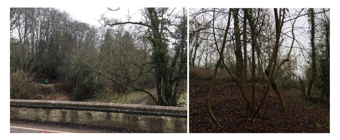
Figure 3 – View from Heyford Bridge (left) and from footpath leading to Cuttle Mill<sup>2</sup> (right), looking north towards the proposed site, showing that the site is not visible.

1.7 A site visit was carried out on 05 February 2019. Observations and photographs from that site visit are incorporated into this report.