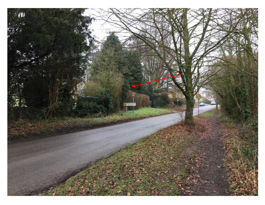
Figure 7 – View from south to north along Heyford Road. The boundary of Rousham Conservation Area is the road. An arrow points to the location of The Beeches.

3.10 The Beeches is located close to the west boundary of Rousham Conservation Area. This part of the conservation area is along Heyford Road and located on a hill. A large woodland is located on the south part of the hill, which has been in existence since at least the 19<sup>th</sup> century, when it was known as Dean Plantation (Figure 5). The woodland and trees that line Heyford Road mean that while the hill and woodland itself can be seen from long distances, smaller features and buildings like the roads and houses cannot be easily seen. Due to the trees, vegetation and the rising topography of the land views in this part of the conservation tend to be obstructed and only from short distances (Figure 7). Longer views of the valley are not possible from the footpath on the east side of the road (within the conservation area) due to the trees and vegetation (Figure 8), and it is only possible to get longer views of the valley if you are to walk through the vegetation and into the fields on the east side of the road.