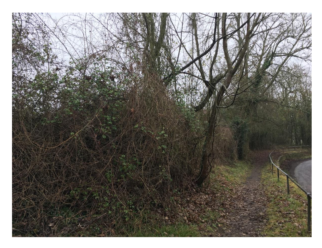
Figure 8 – View from the east footpath by Heyford Road towards Rousham House and the Cherwell valley.

Contribution of the site to the setting of Rousham Conservation Area