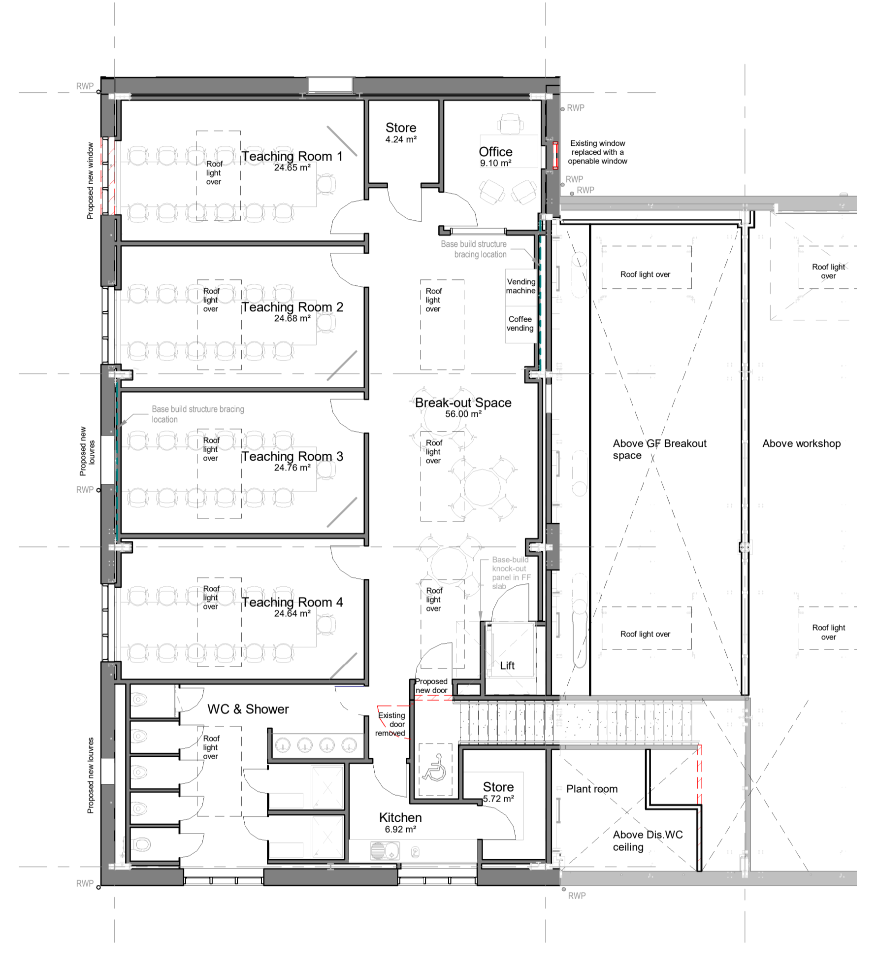
Proposed Plan - First floor 1 : 100