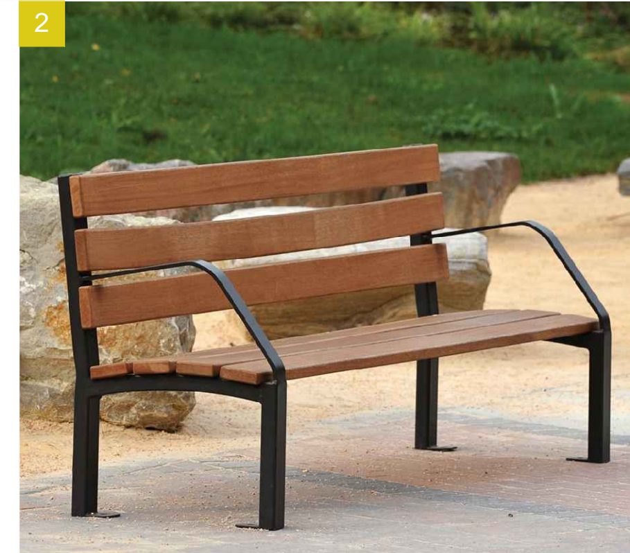
Broxap Medway Seat Code: BX144026