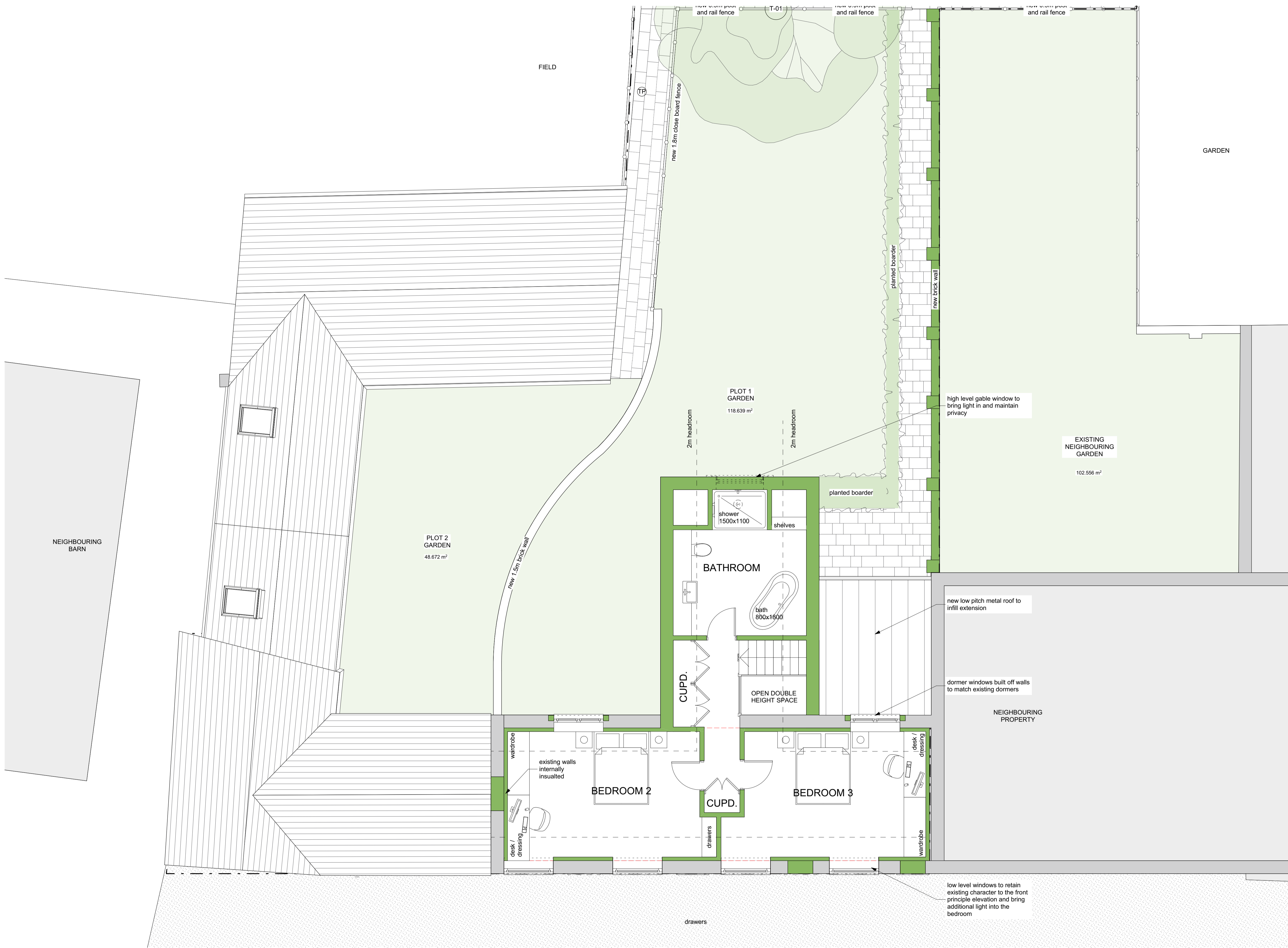
B | PROPOSED FIRST FLOOR PLAN 114 | Scale: 1:50 @ A1 / 1:100 @ A3