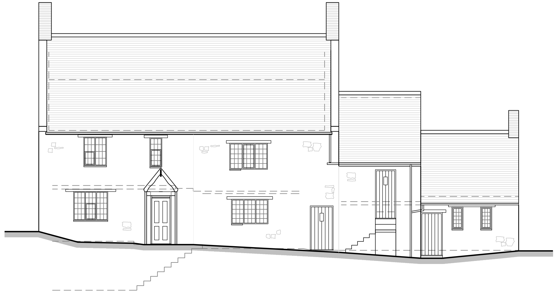
Existing South (Front) Elevation Scale: 1:100

Materials: Walls: Randomly Coursed Ironstone Roof: Concrete Tiles Windows: Timber & Crittal Glazed Casements Doors: Timber