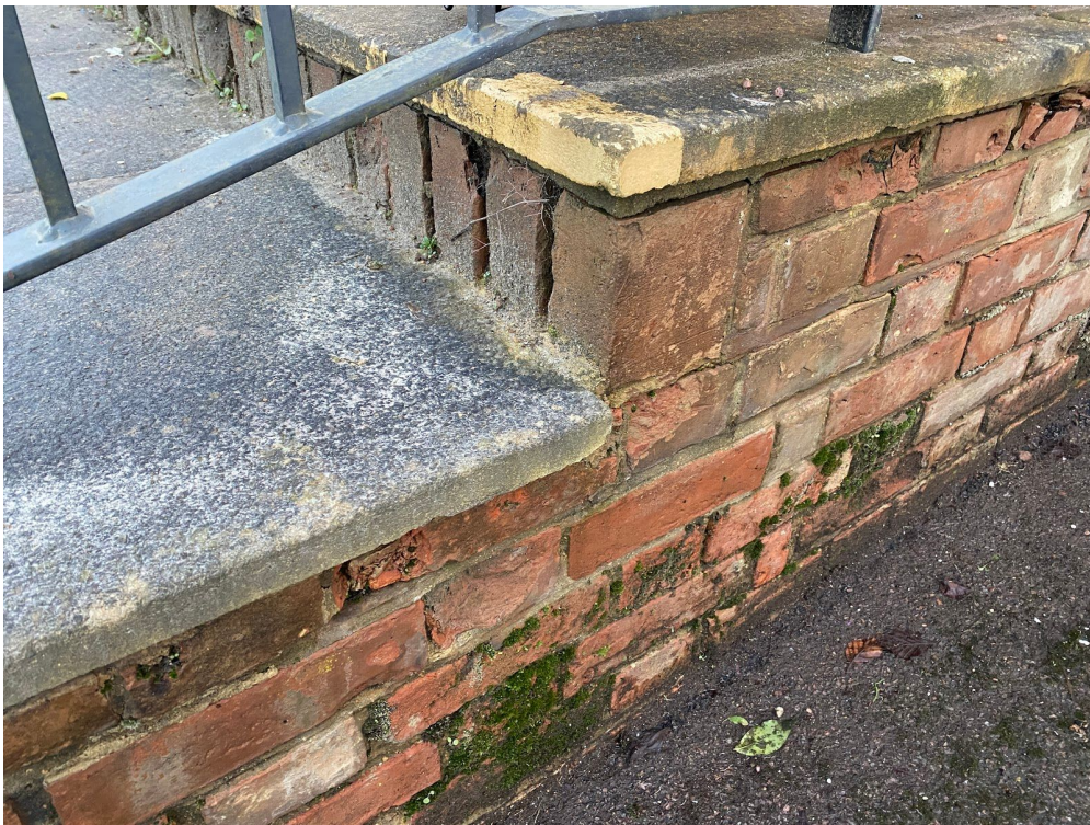
Many of the bricks have blown and new bricks (of the same style and colour) need putting in their place. The front facing bricks may be replaced with stone for long term durability.