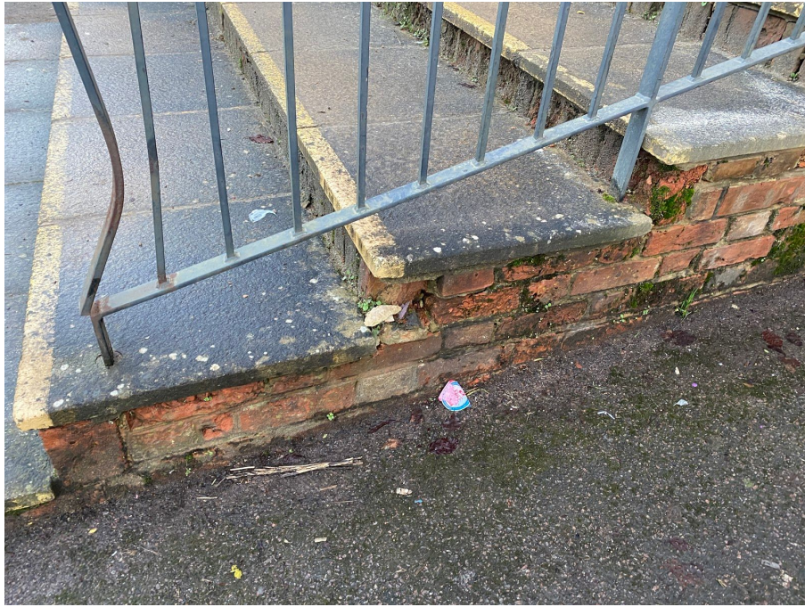
The rail is bent and needs repair.