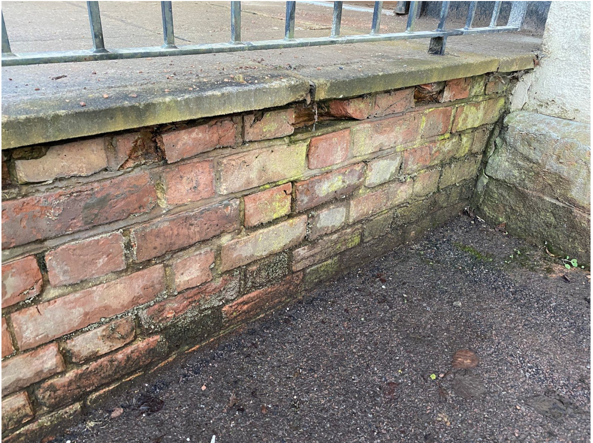
The side bricks are blown.