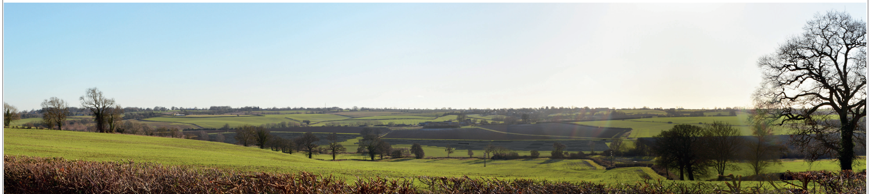
Proposed Photomontage Viewpoint 11 at 0 Years Post Construction: Looking south from Plumdon Lane, directly north of Duns Tew.