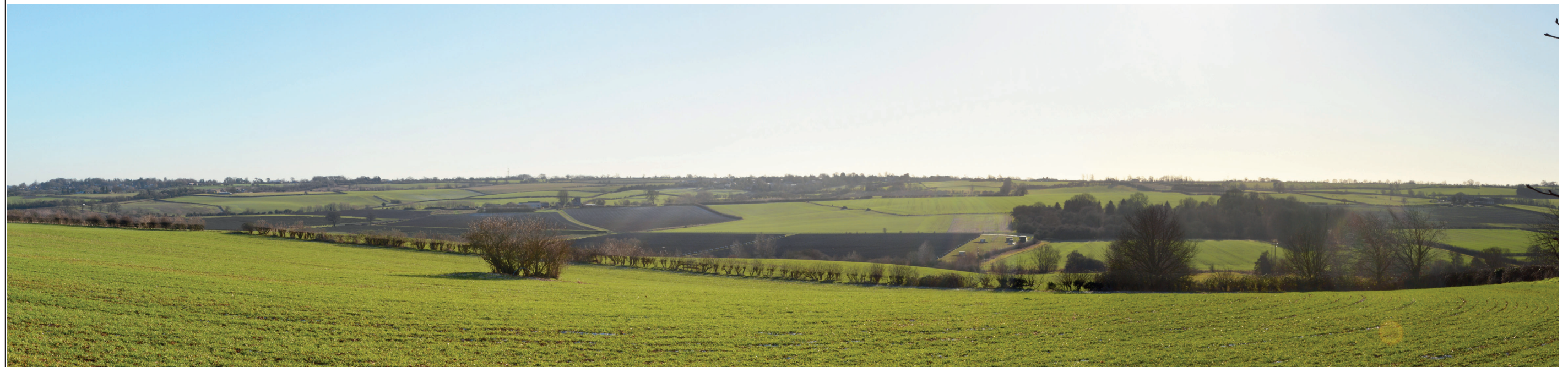
Proposed Photomontage Viewpoint 8 at 0 Years Post Construction: Looking south from Plumdon Lane, adjacent to Tomwell Farm.