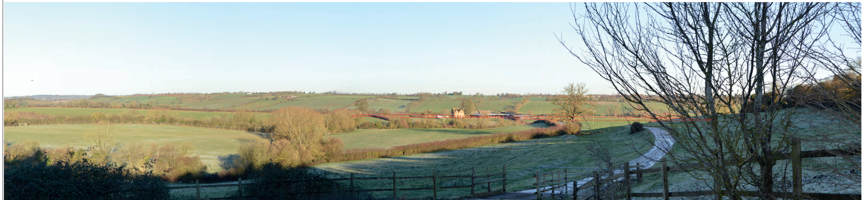
Proposed Photomontage Viewpoint 1 at 0 Years Post Construction: Hill Farm Lane, Duns Tew, looking northwest.