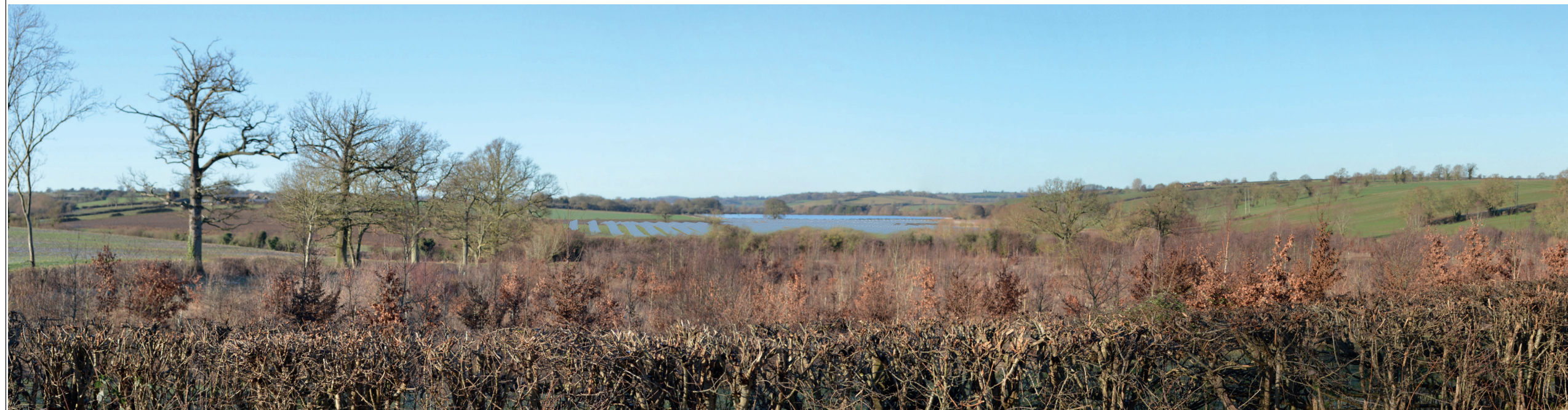
Proposed Photomontage Viewpoint 3 at 0 Years Post Construction: Area beside Oxford Road (A4260), looking west.