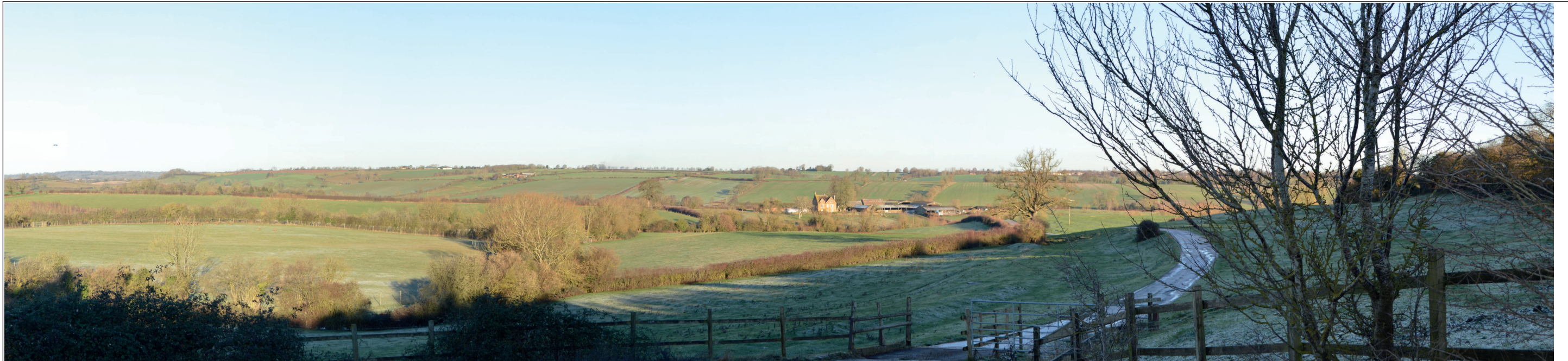
Proposed Photomontage Viewpoint 1 at 15 Years Post Construction: Hill Farm Lane, Duns Tew, looking northwest.