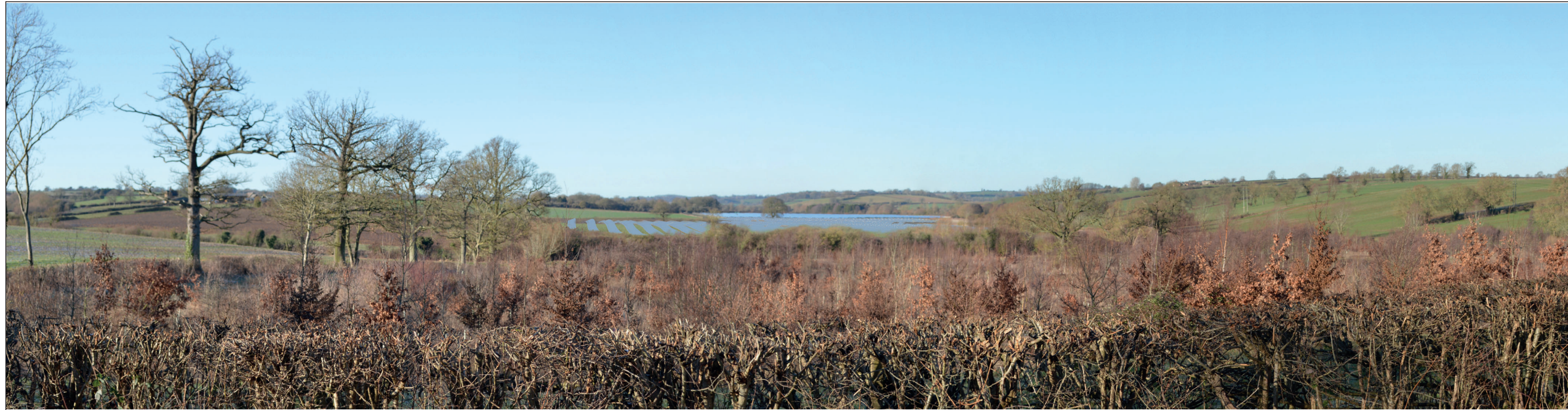
Proposed Photomontage Viewpoint 3 at 15 Years Post Construction: Area beside Oxford Road (A4260), looking west.