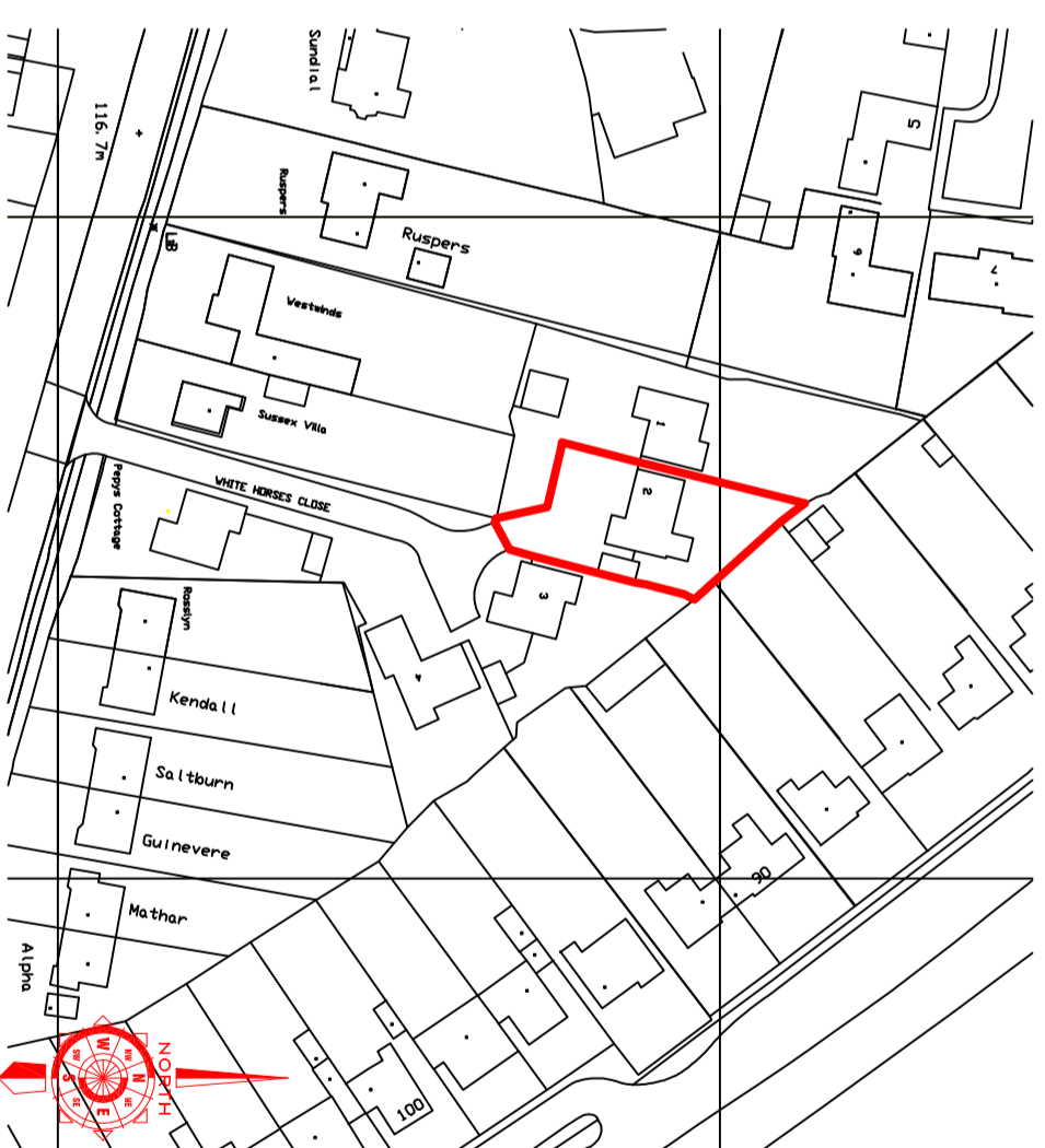
Existing Location Plan 1:1250