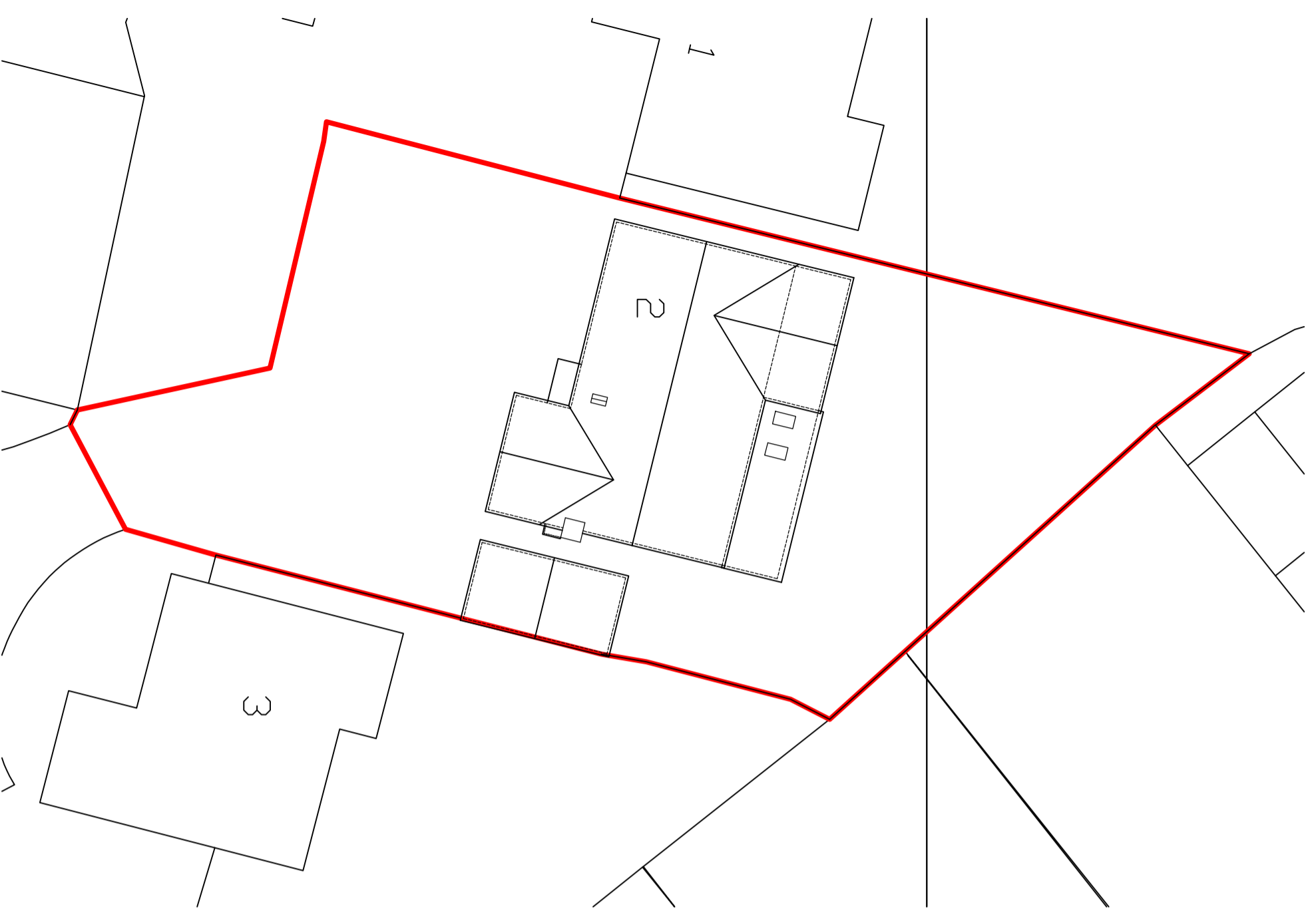
Site Plan 1:200