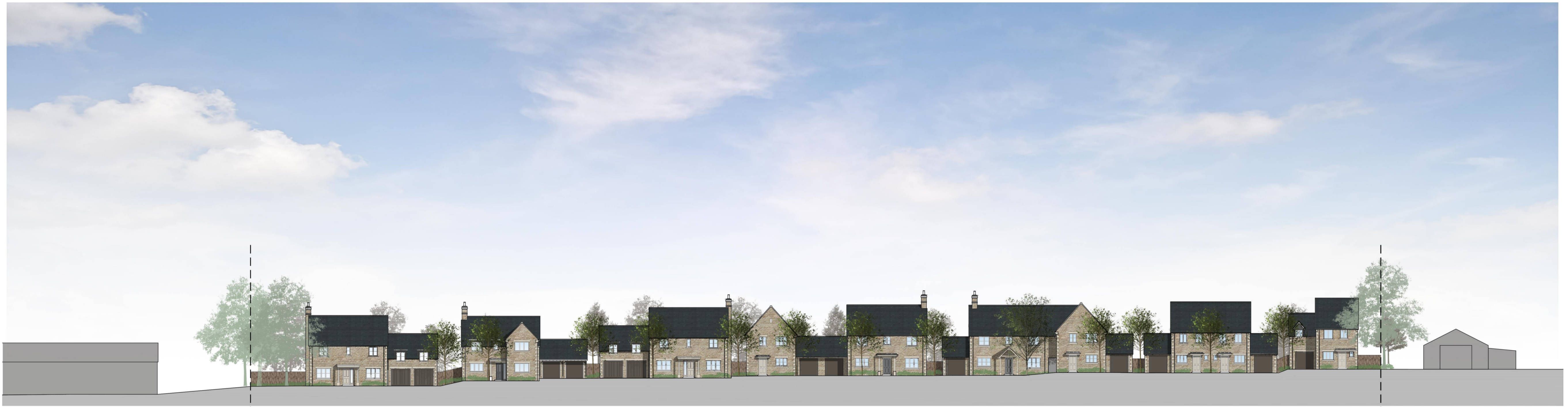
Street Scene from on site road