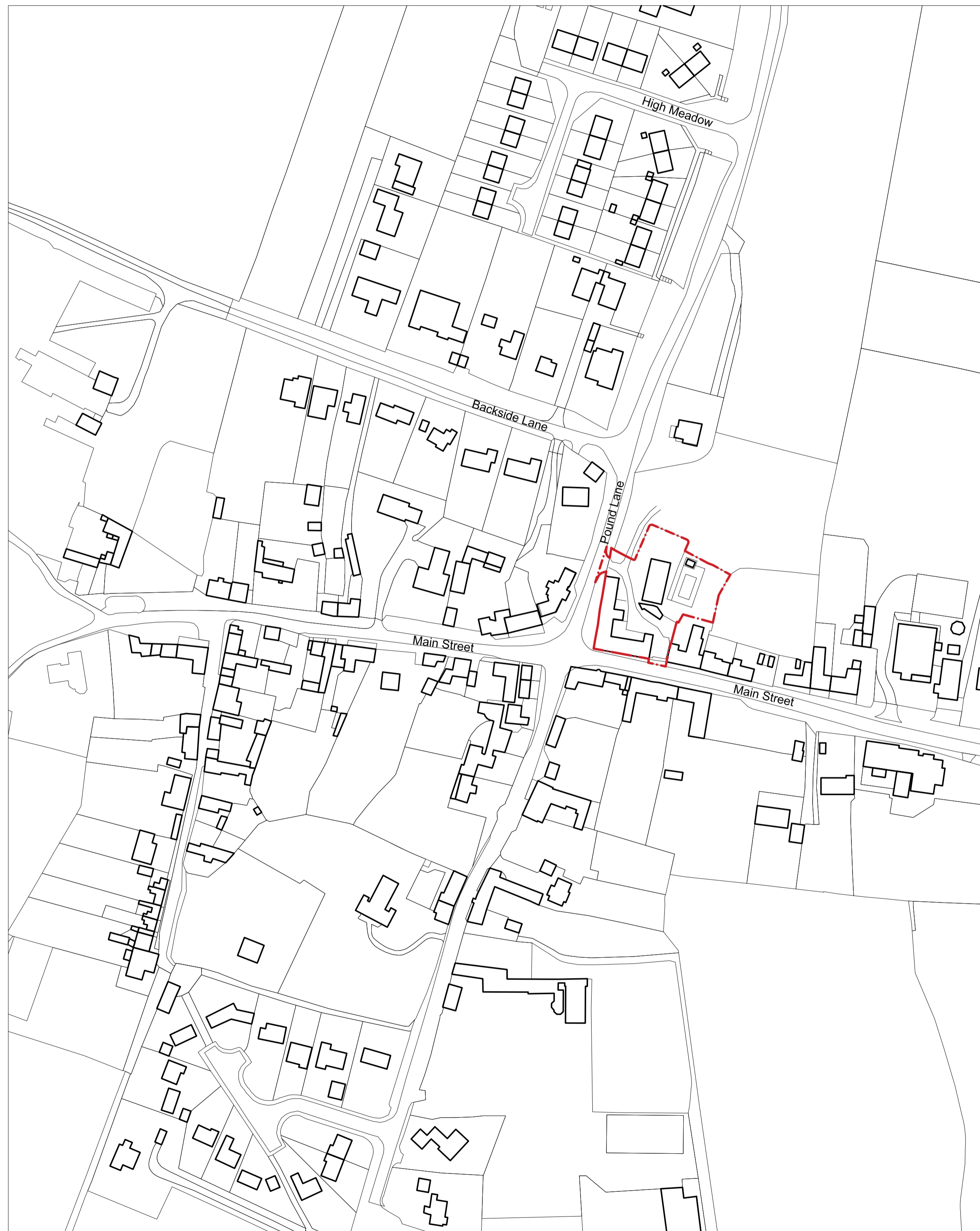
01 Location Plan 1:1250