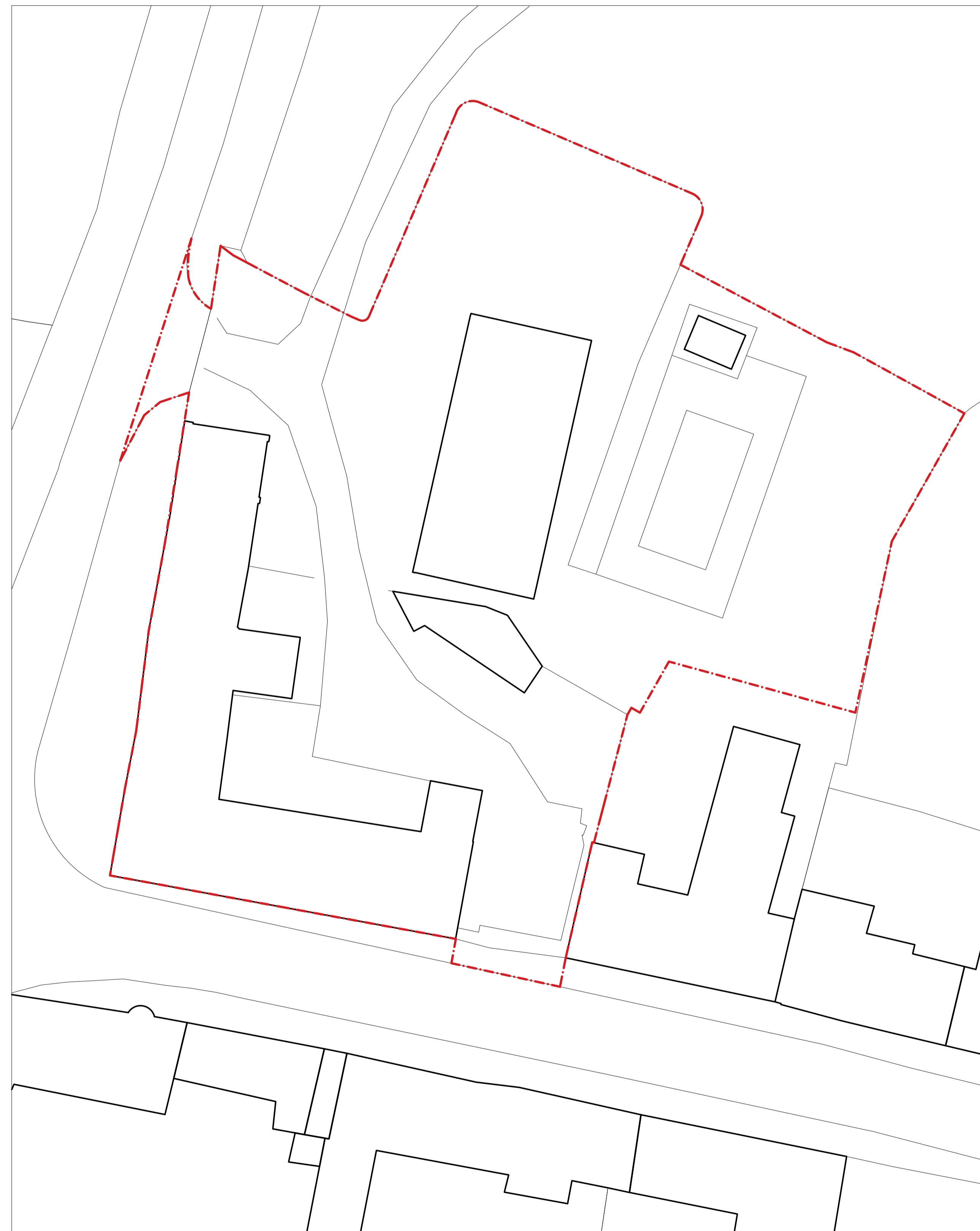
02 Existing Block Plan 1:200