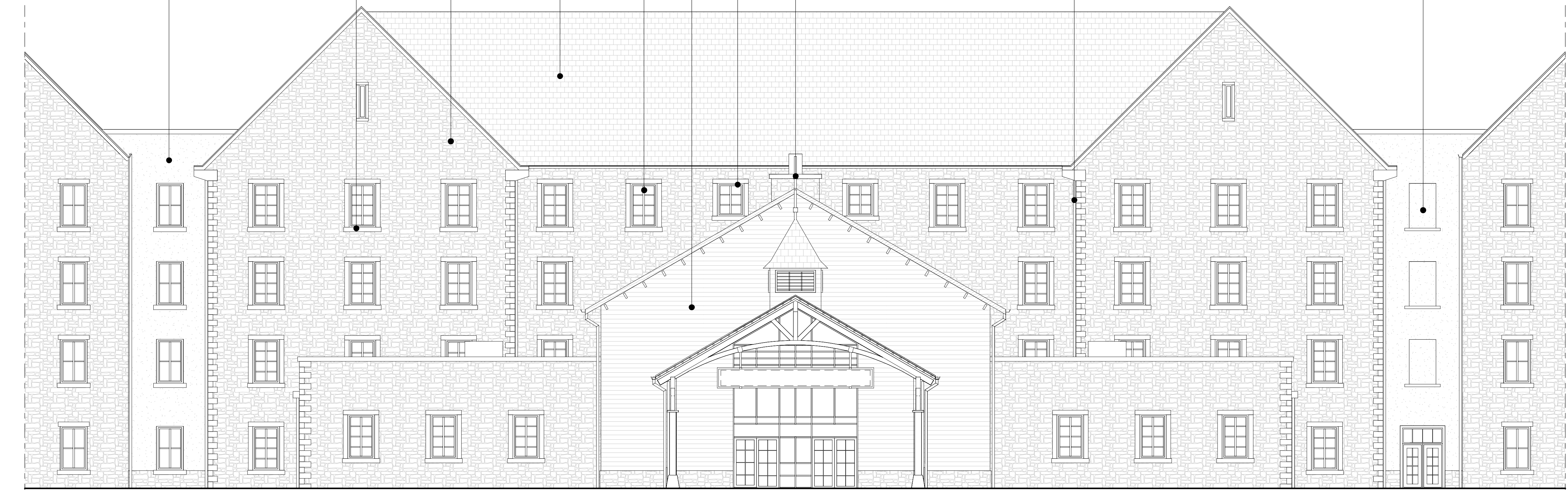
2 04-0001 NE Elevation - Part 2 1:100

WA-2 WA-2 WA-3 DT-1 WA-1 WA-1 RF-1 RF-2 WI-4 WA-3 WI-1 DR-3 DT-8 DT-3 WI-4 WI-1 DT-4 RF-2 WI-2 DR-4 WA-2 DT-1