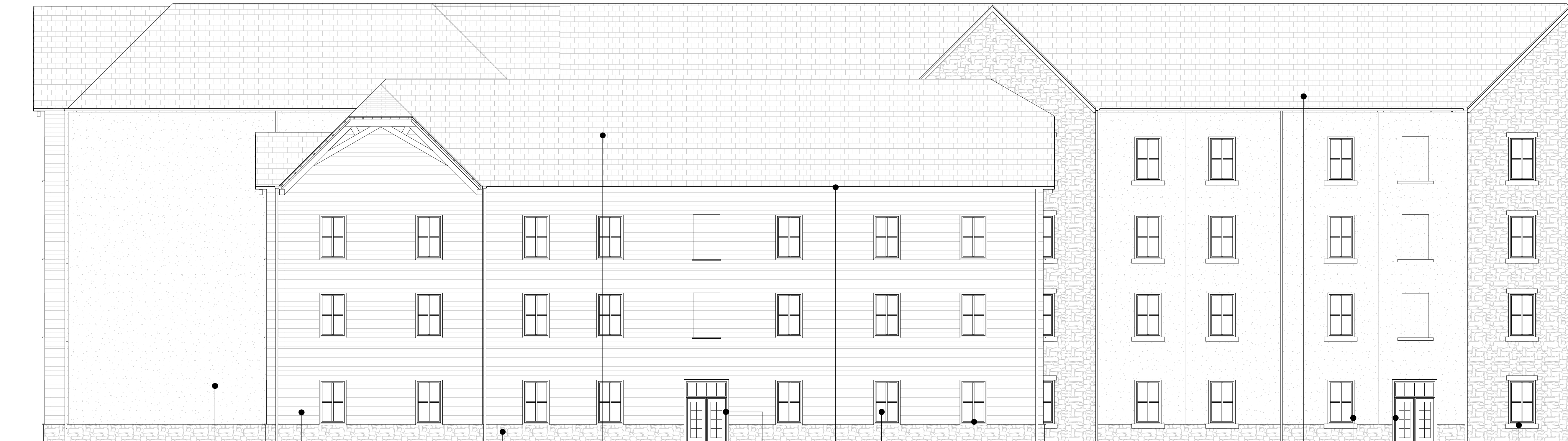
1 04-0001 NE Elevation - Part 1 1:100

WA-2 WA-2 WA-3 DT-1 WA-1 WA-1 RF-1 RF-2 WI-4 WA-3 WI-1 DR-3 DT-8 DT-3 WI-4 WI-1 DT-4 RF-2 WI-2 DR-4 WA-2 DT-1