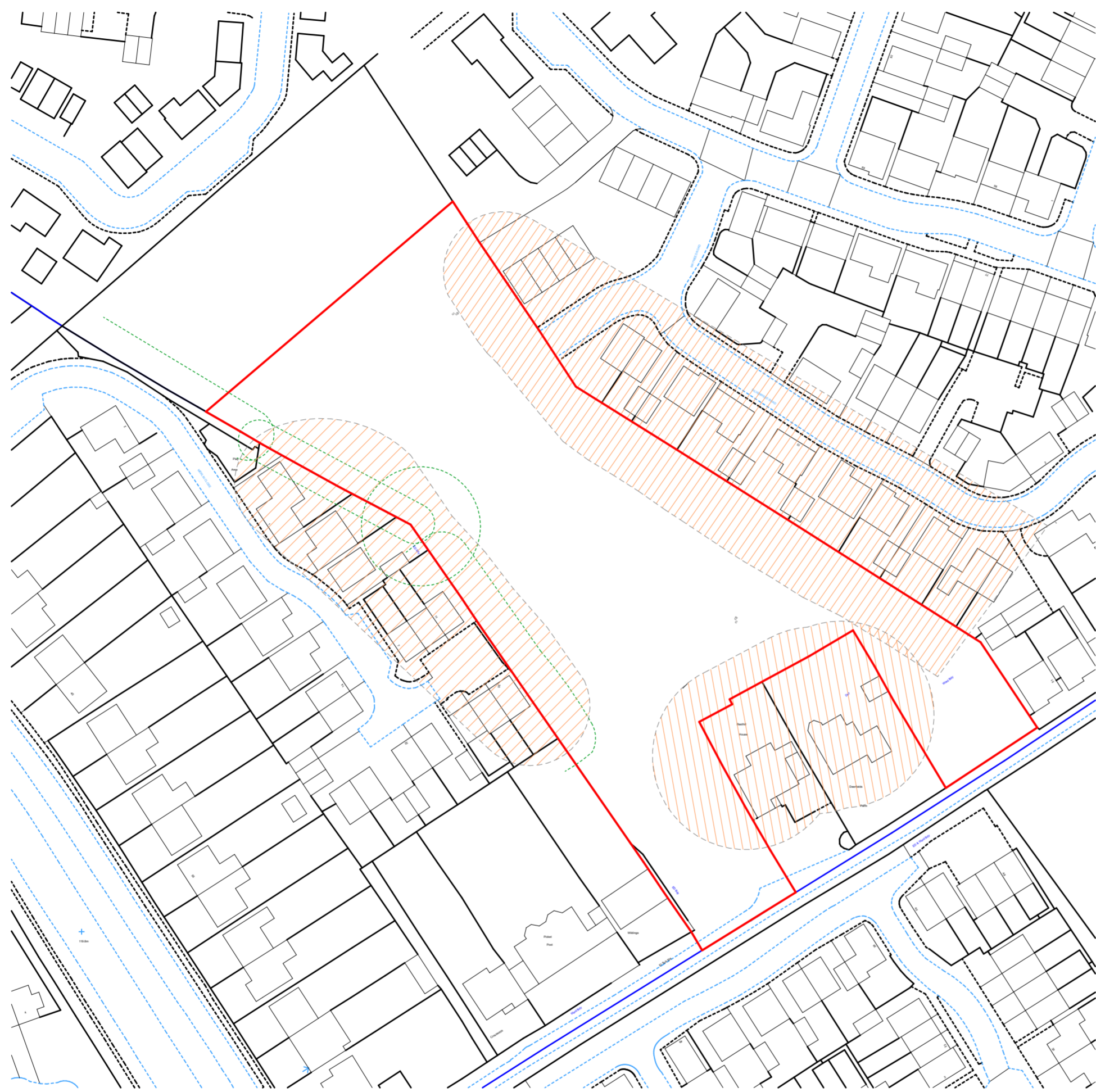
1 Site Plan Setting Out Proposed 1:1000