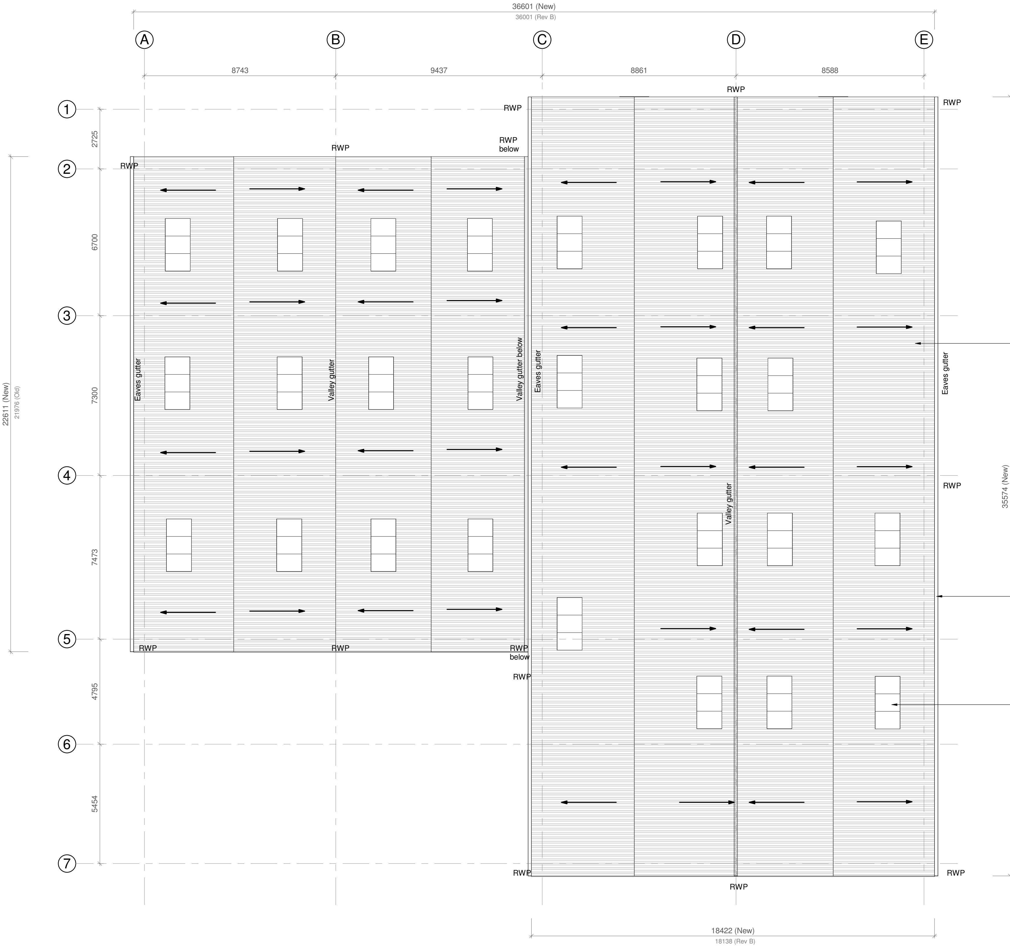
Roof Plan 1 : 100