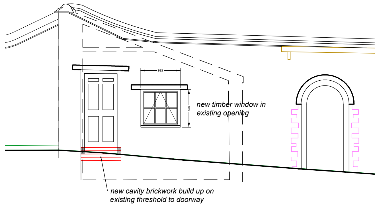
W2 870(h) x 915 clear opening YARD ELEVATION 1:50

B BReg Issue 03/09 tw A Tender Issue 27/06 tw