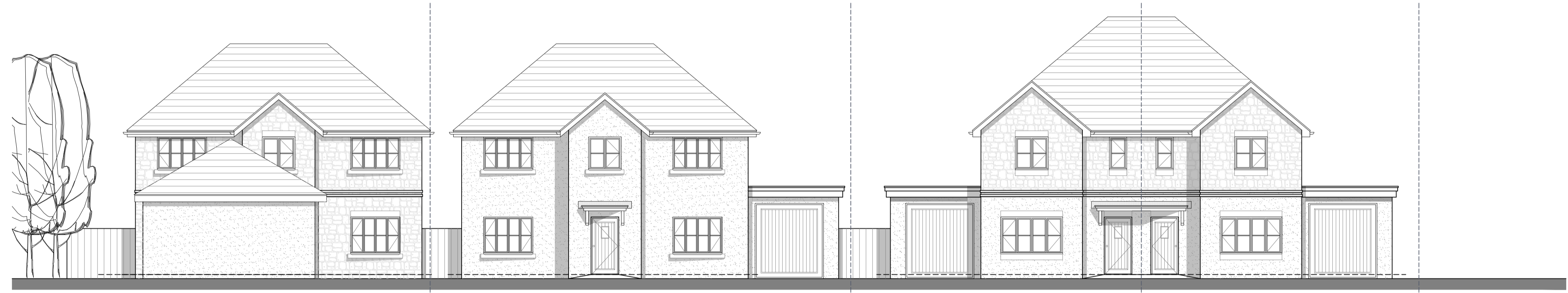
Street Elevation AS PROPOSED