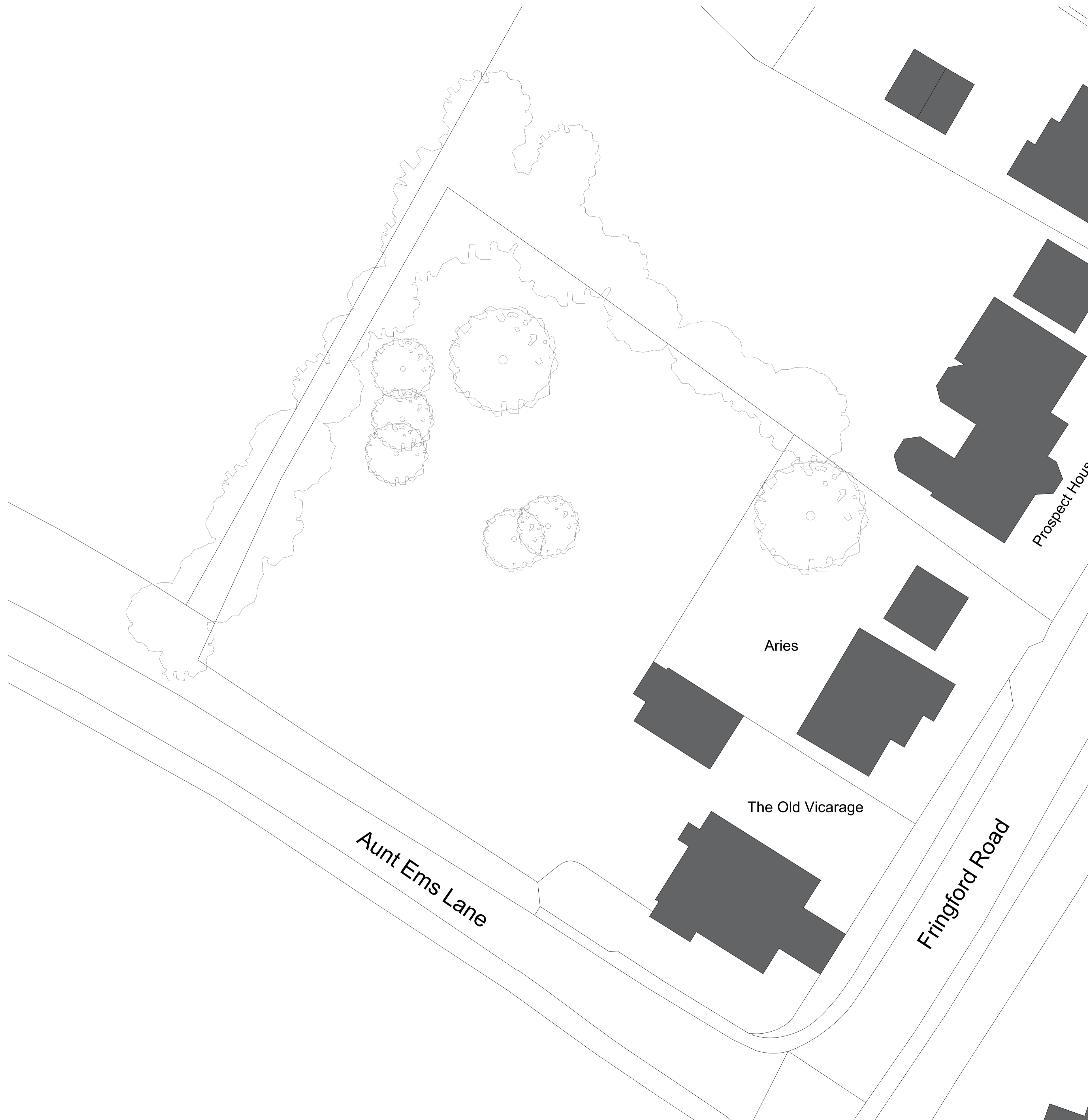
Site Plan AS EXISTING Scale 1:200