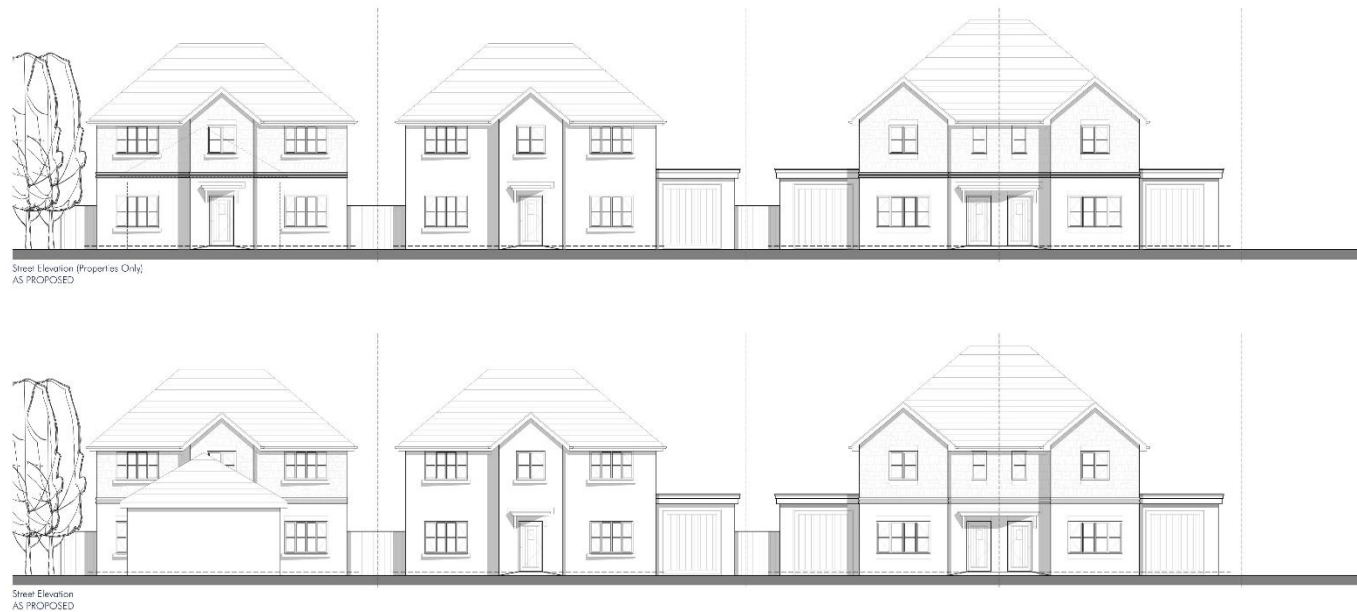
Figure 8 – Proposed street elevation within the site.