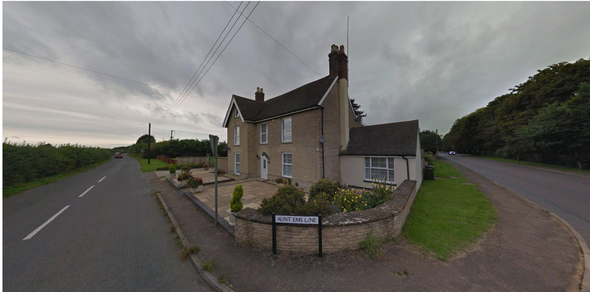
The Old Vicarage

Mr & Mrs Purewal Proposed construction of 4 new dwellings to the side of the existing property.