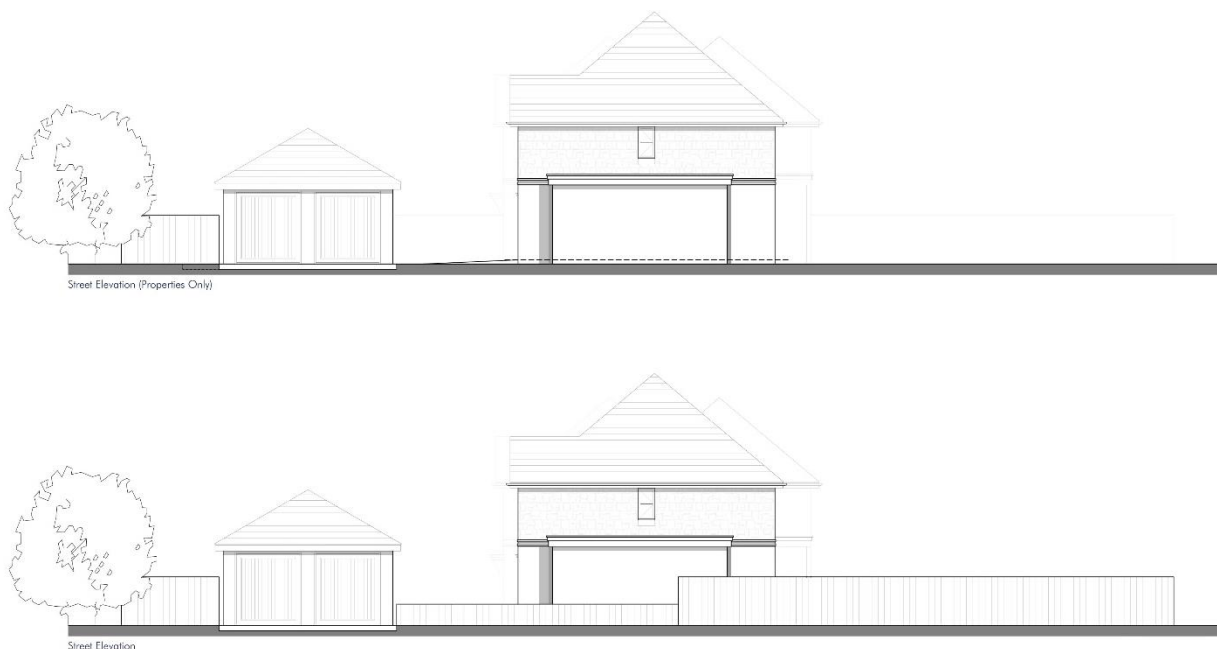
Figure 9 – Proposed street elevation from Aunt Ems Lane

properties running parallel in Fringford Road. A full list of the nearest nearest point from each plot is below: