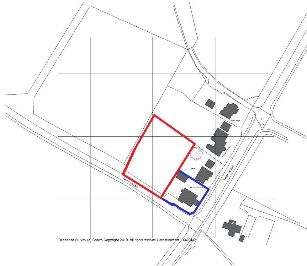
Figure 1 - Site Plan (site boundary in red)