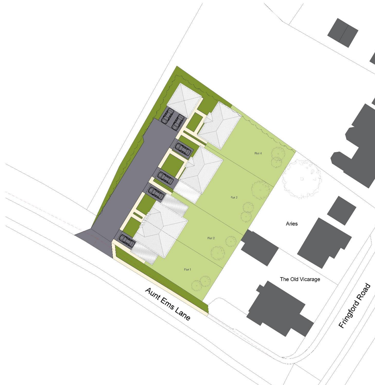
Figure 6 – Proposed Site Plan (Colour)

The existing building is not believed to have any issues with regards contamination, nor the wider site itself.