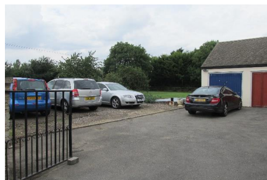
Figure 3 – Photos of and towards the existing property