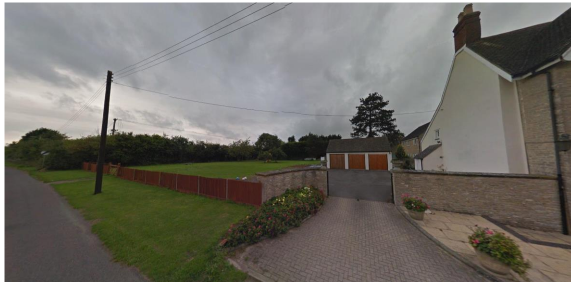
Figure 2 - The proposed development site