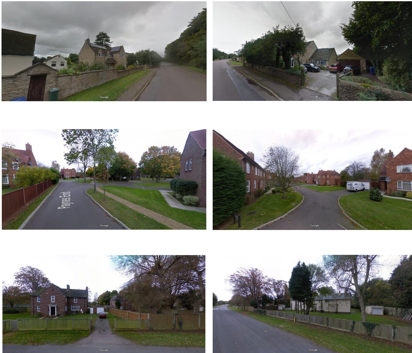
Figure 4 – Photos of local context

CHS.646/88 – Erection of two detached dwellinghouses & access (outline) – Refused