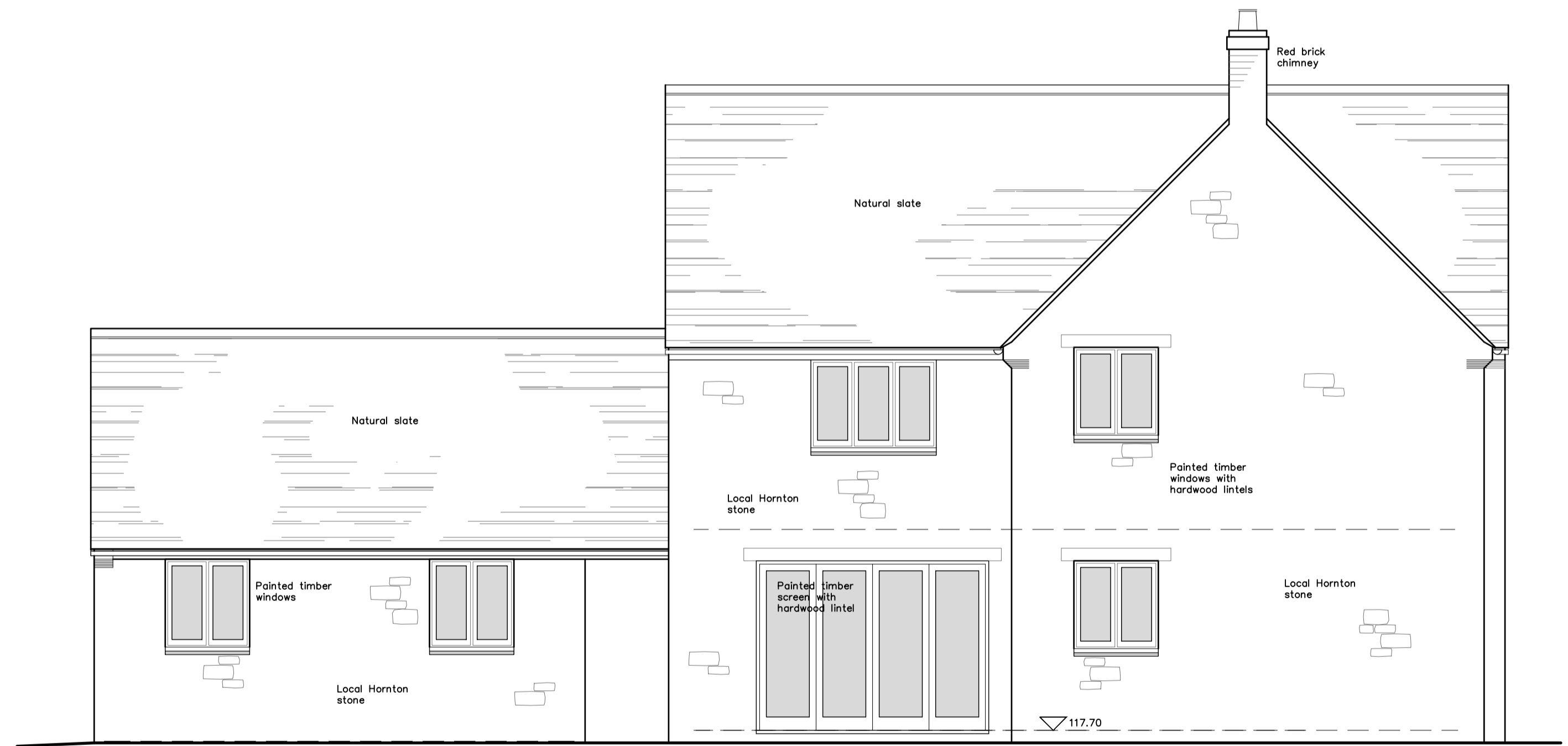
East Elevation (Plot 3)