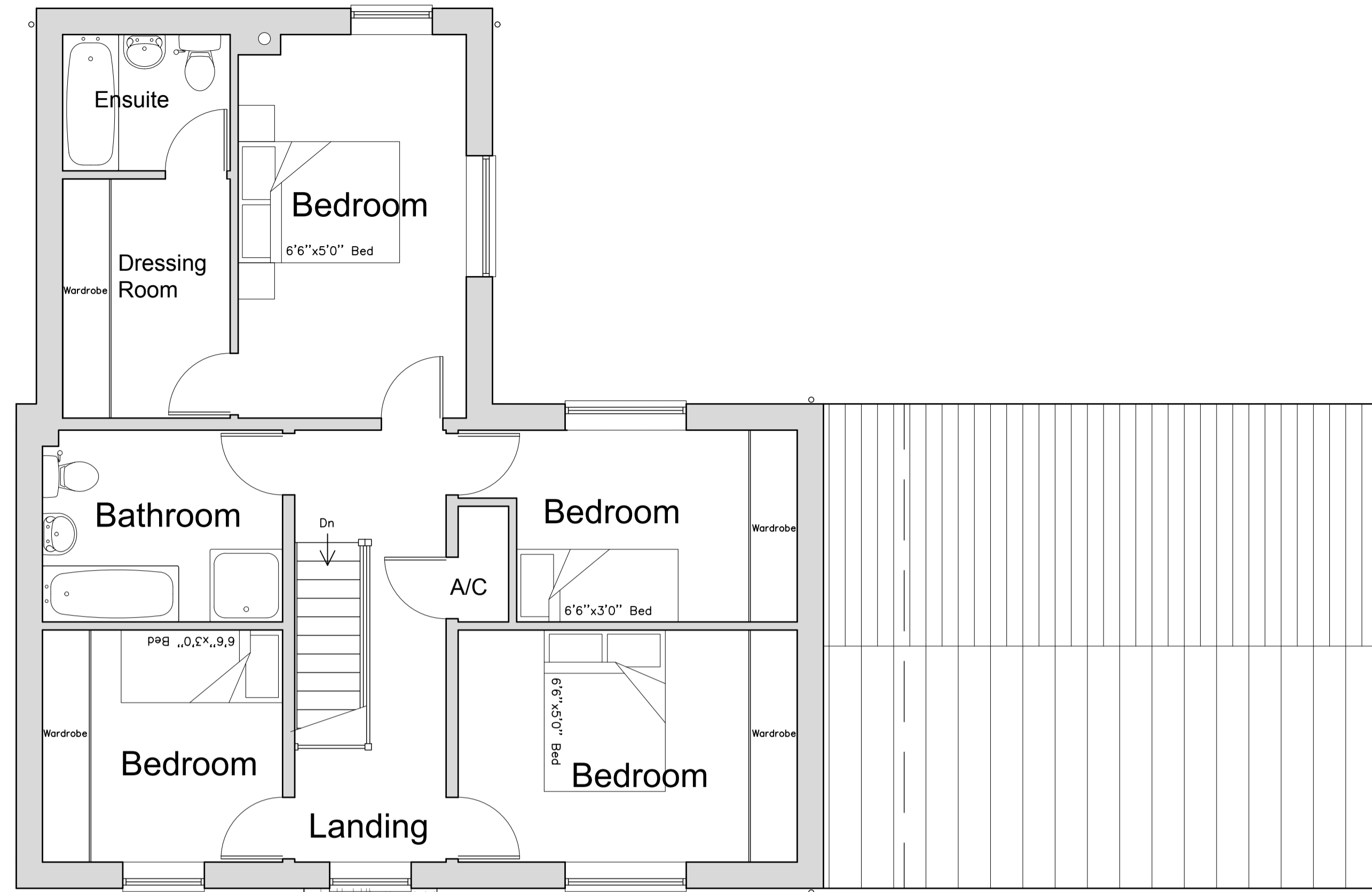
First Floor Plan (Plot 3)