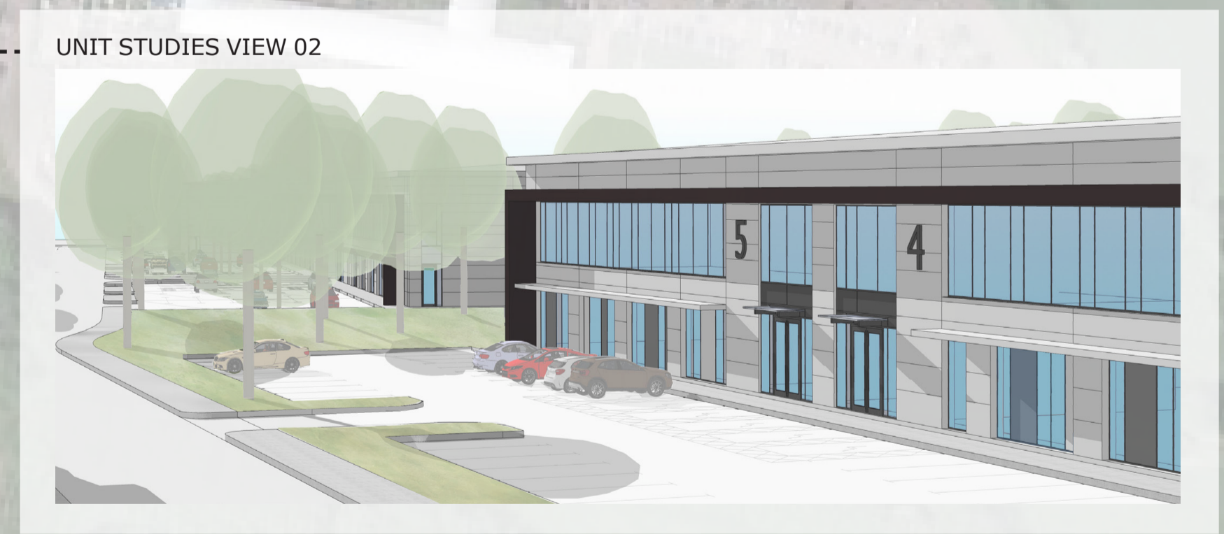
UNIT STUDIES VIEW 02