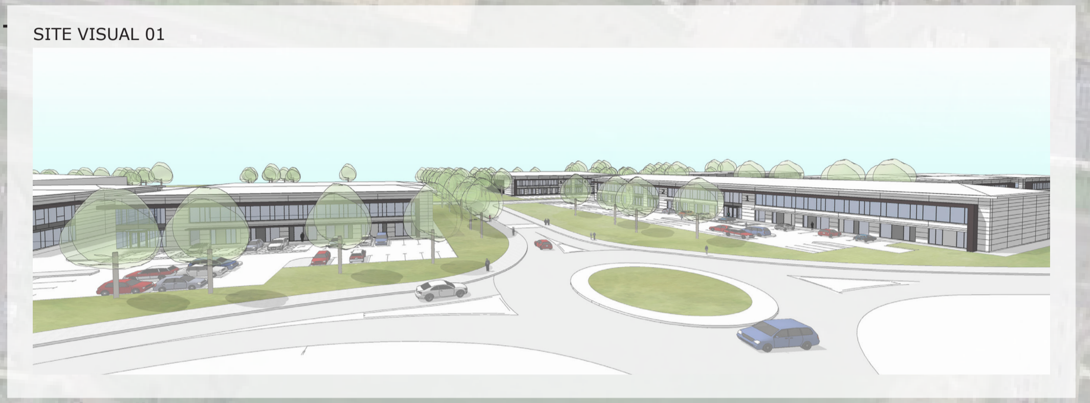
SITE VISUAL 01