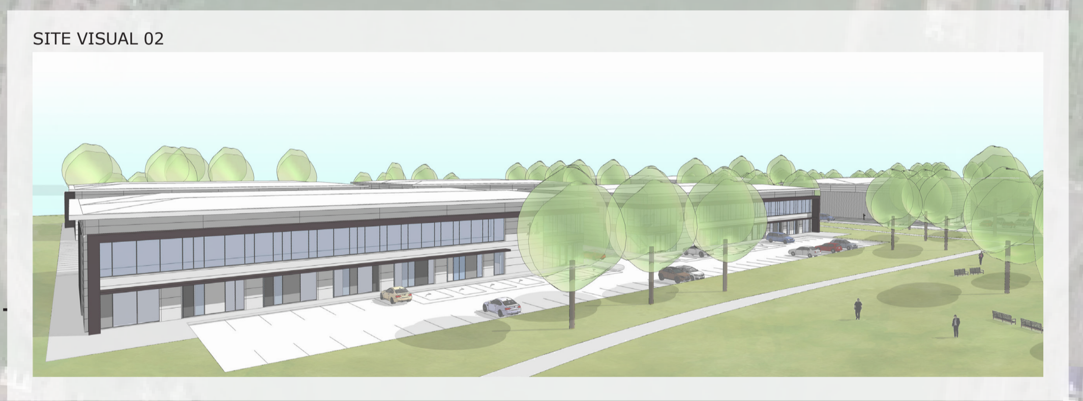
SITE VISUAL 02