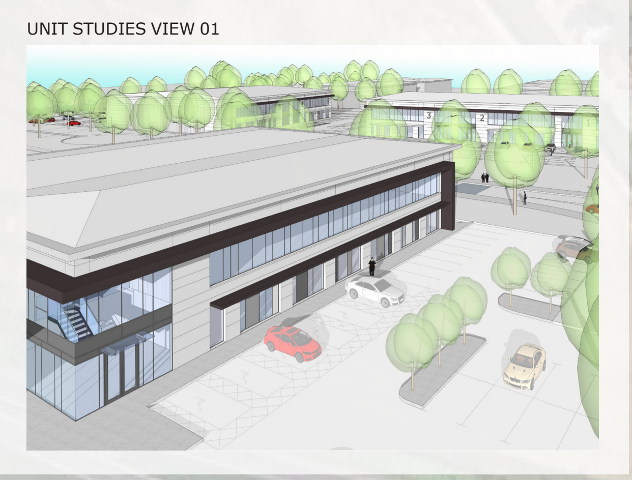
UNIT STUDIES VIEW 01