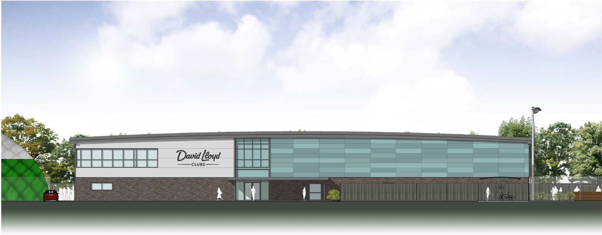
ELEVATION A - NORTH WEST “FRONT” ELEVATION