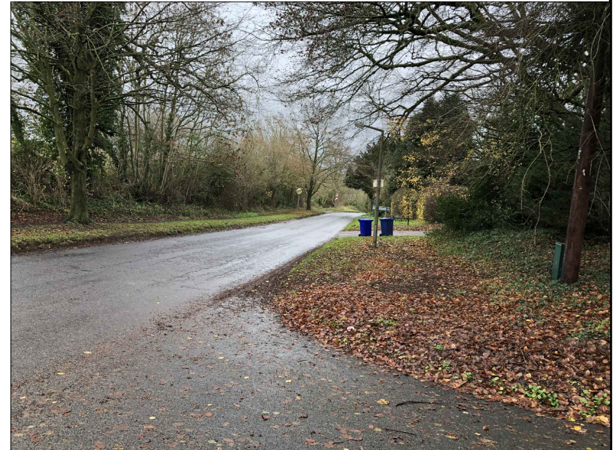
Visibility to right of site access