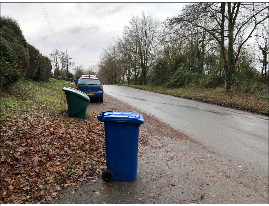
Visibility to left of site access