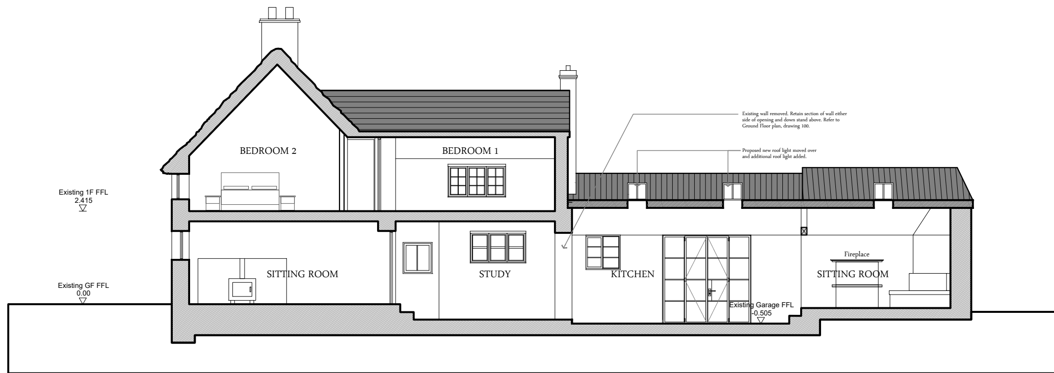
PROPOSED SECTION AA'