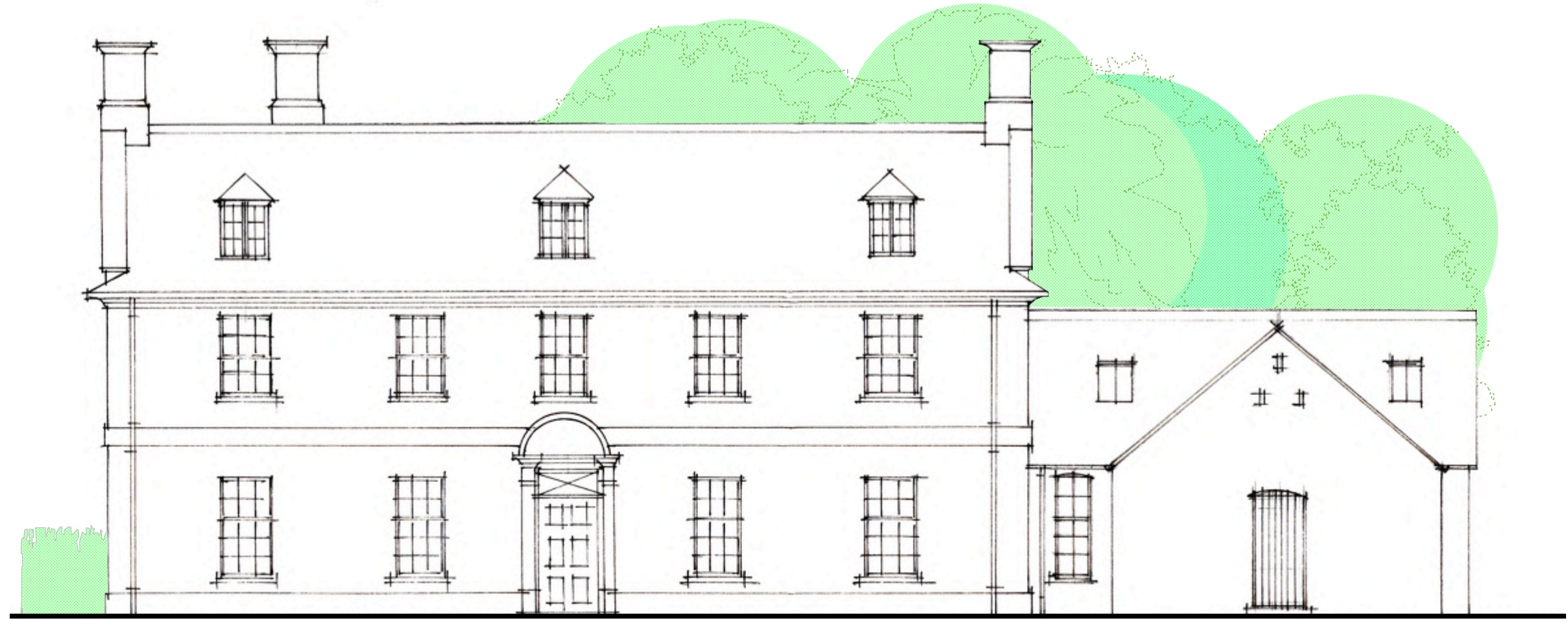
Proposed East Elevation (Front)