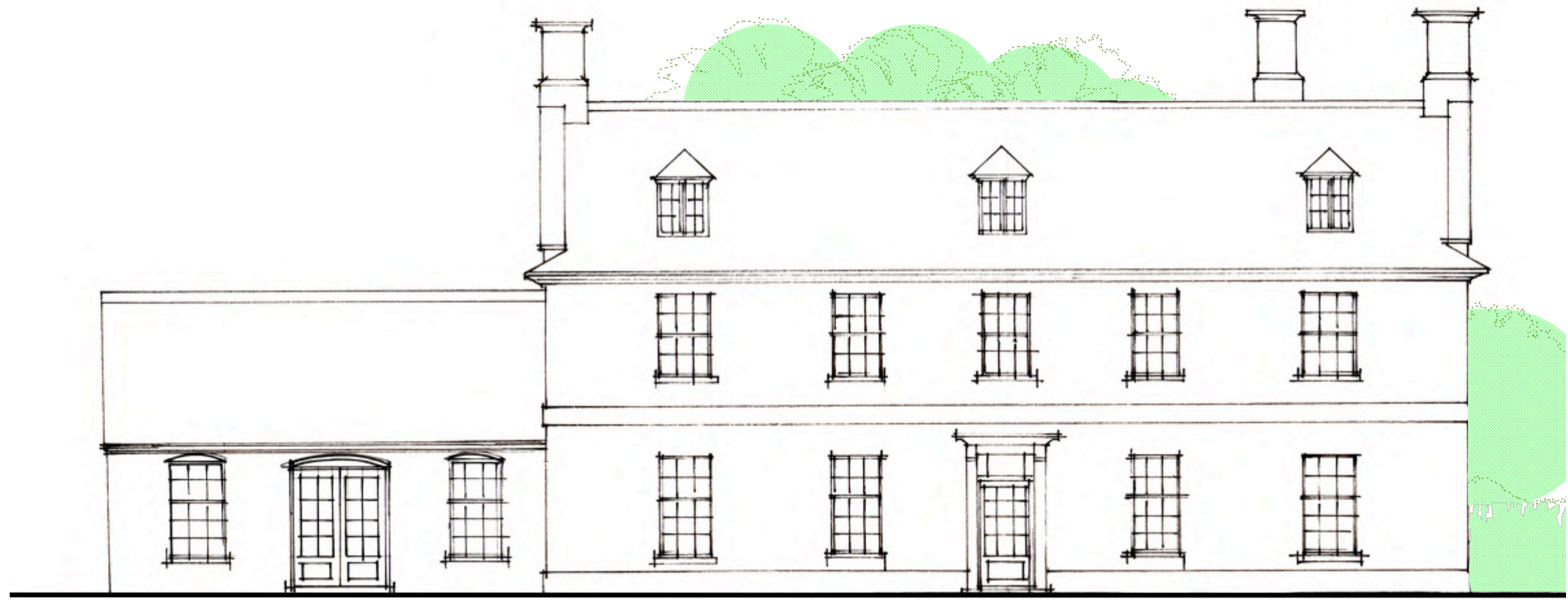
Proposed West Elevation (Garden)

MATERIALS: Roof - Blue Slate Walls - Hornton Stone Ashlar / Rubble Windows / Door - Painted Hardwood Rainwater Goods - Painted Cast Iron Dormer Cheeks - Render Chimneys - Ashlar