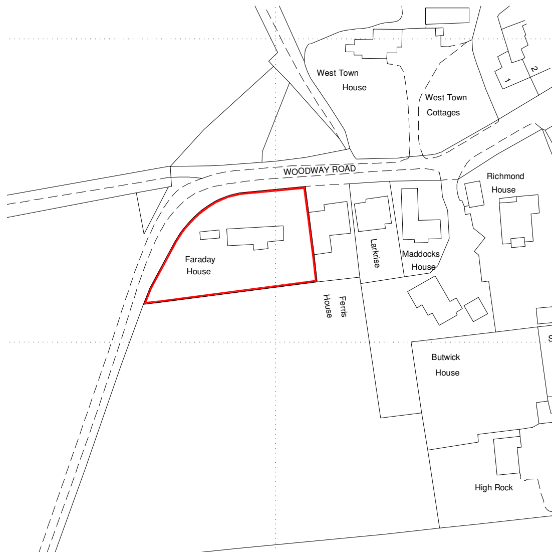
1 Scale: 1:1250 Site Location Plan

Note: All levels and dimensions to be site surveyed and confirmed by the contractor. See also architectural details, mechanical and electrical intent layout and structural engineers drawings and specifications. Door and windows manufacturer to produce shop drawings for comment before manufacture. All details are intent only, to be finalised by the contractor. Drawings subject to statutory approvals.