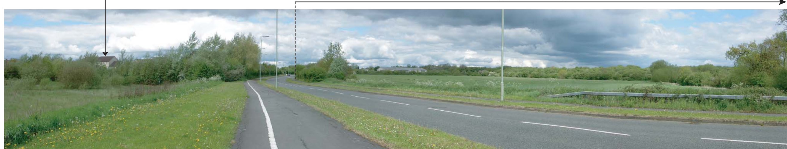
Photoviewpoint 4: From the bridge crossing the Langford Brook, looking west along Gavray Drive, clear views are available across the western portion of the application area.