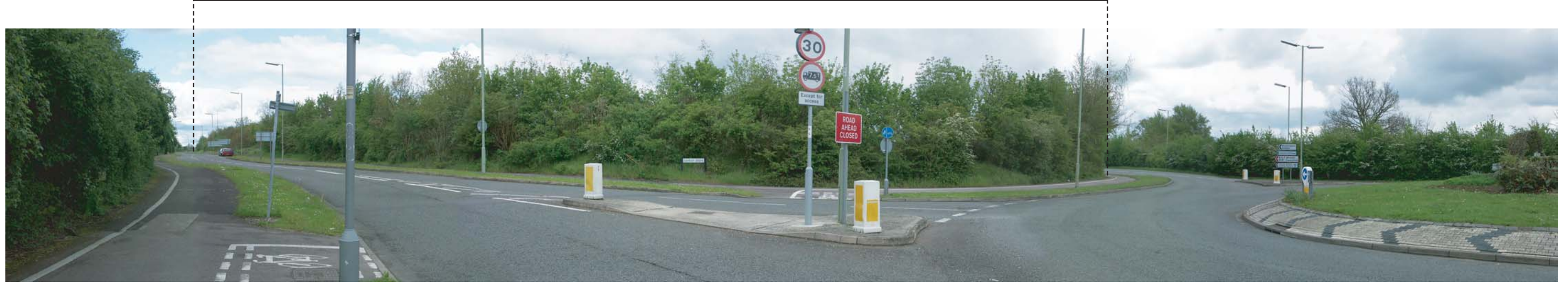
Photoviewpoint 3: From the eastern end of Gavray Drive, looking northwards towards the site, the dense boundary vegetation is evident.

Three storey residential dwellings associated with Bicester Fields Farm