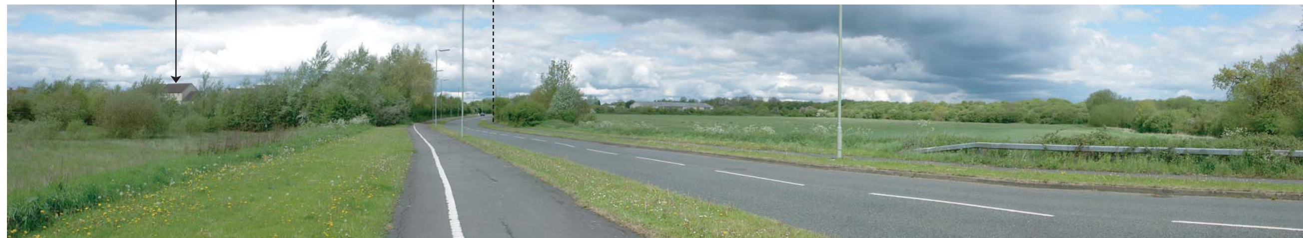
Photoviewpoint 4: From the bridge crossing the Langford Brook, looking west along Gavray Drive, clear views are available across the western portion of the application area.