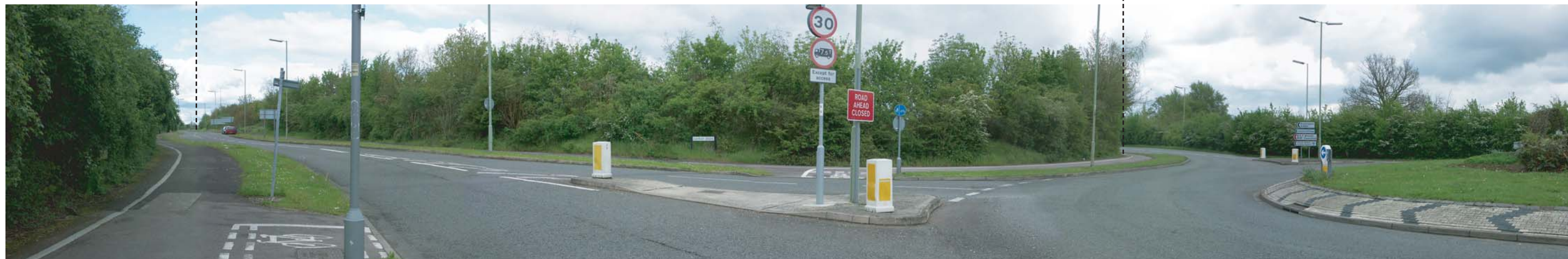
Photoviewpoint 3: From the corner of Gavray Drive, looking northwards towards the site, the dense boundary vegetation is evident.

Three storey residential dwellings associated with Bicester Fields Farm